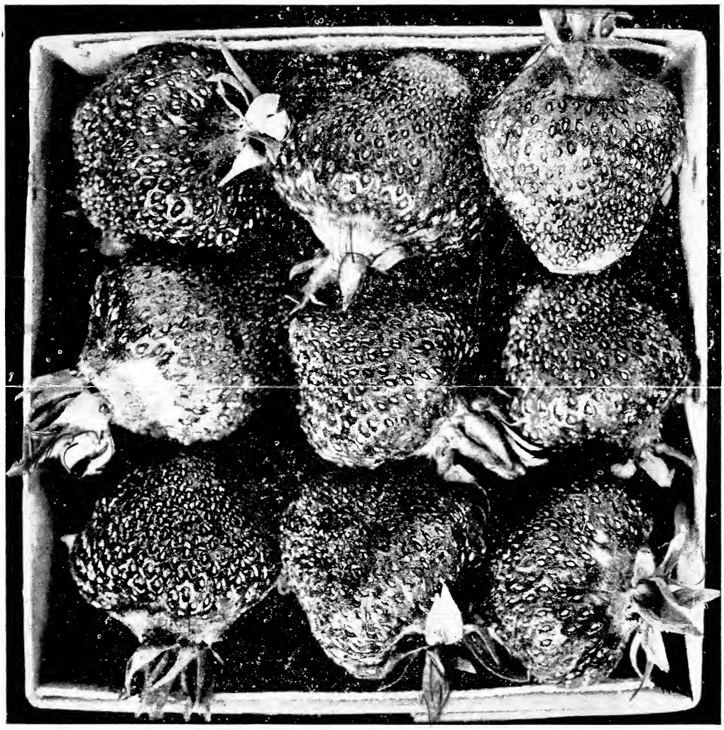
Top Layer of a quart box of Minnesota No. 3 Strawberries (Actual Size)