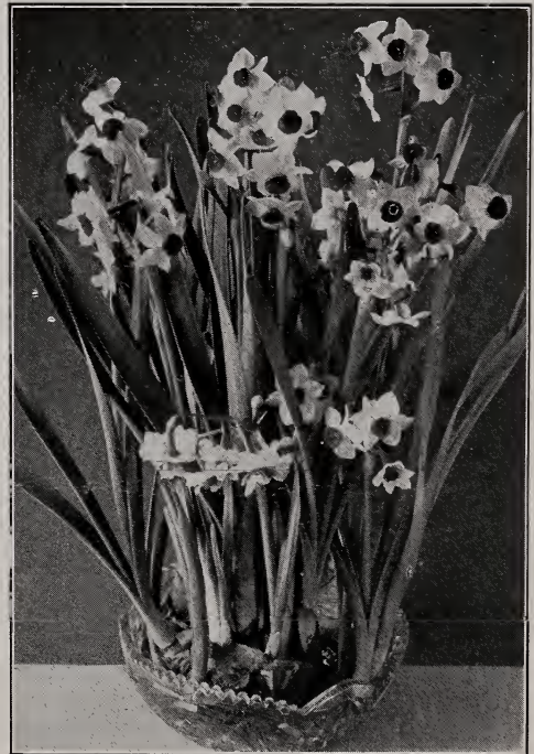
Chinese Sacred Lily