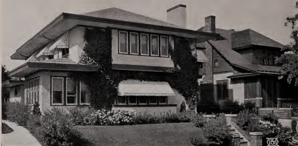
The home-like appearance given by a well-balanced planting