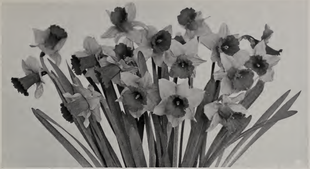
Emperor and Empress