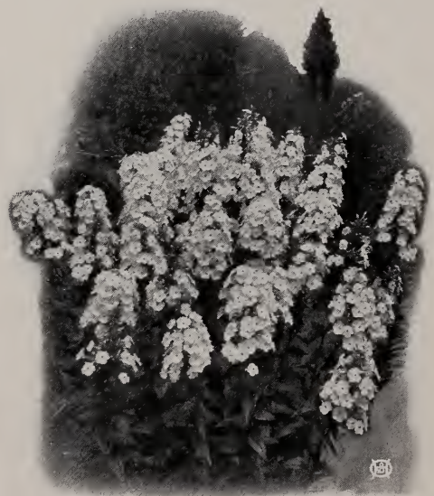
Miss Lingard Phlox