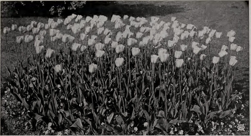
Darwin Tulips, Madame Krelage