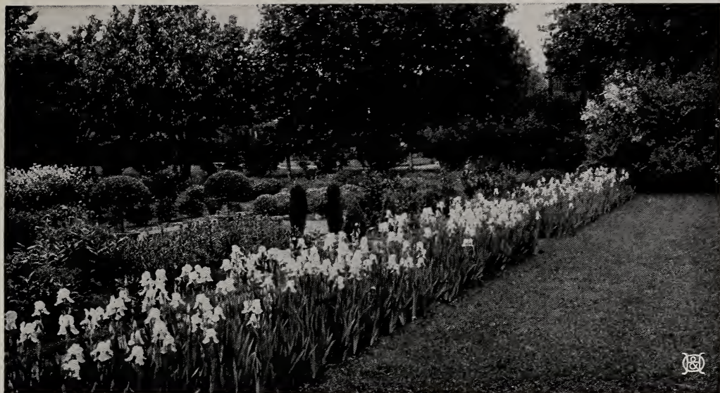
The garden Iris rivals the orchid in dainty coloring and markings