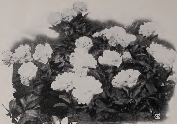
Peonia Festiva Maxima