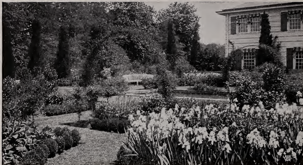
The charm of the old-fashioned garden can be created only by the use of hardy perennials