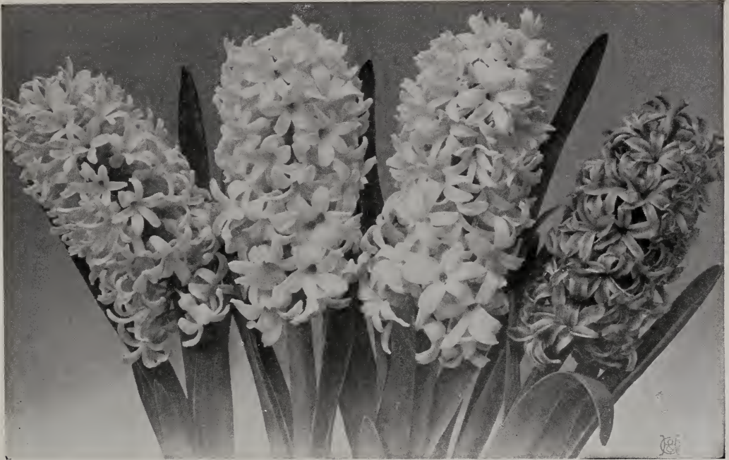
Enchantress Grande Blanche La Grandesse Lady Derby