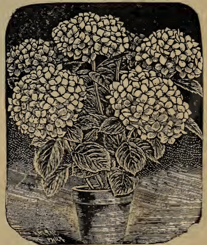
Hydrangea Bouquet Rose.

MME. E. MOUILLERE —This has been the favorite white variety in the New York market this year, very free flowering, of good size and form. Awarded silver medal at the National Flower Show at Boston last year.