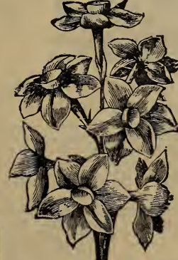
Chalice-flowered Narcissus. cents per dozen.

MRS. LANGTRY —Flowers pure white, star-like. Cup at first slightly tinted, but changes to pure white. Very pretty, exceedingly sweet-scented. A very free bloomer, being fine for forcing as well as for bedding and open ground culture. Price, 8 cents each: six for 40 cents.