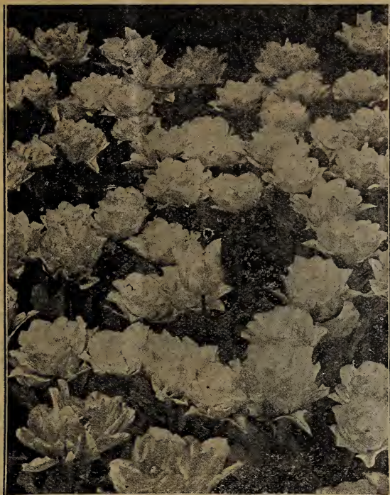
Double Tulip, La Candeur.