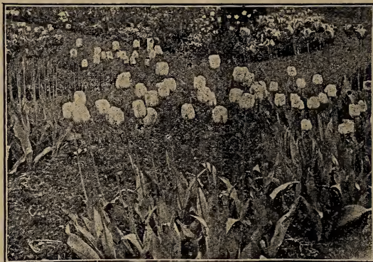
Giant Darwin Tulips.

Our Collection Embraces all the Best Types of the Garden Tulip and Your Order Should Include at Least a Few of These Most Satisfactory Bulbs.