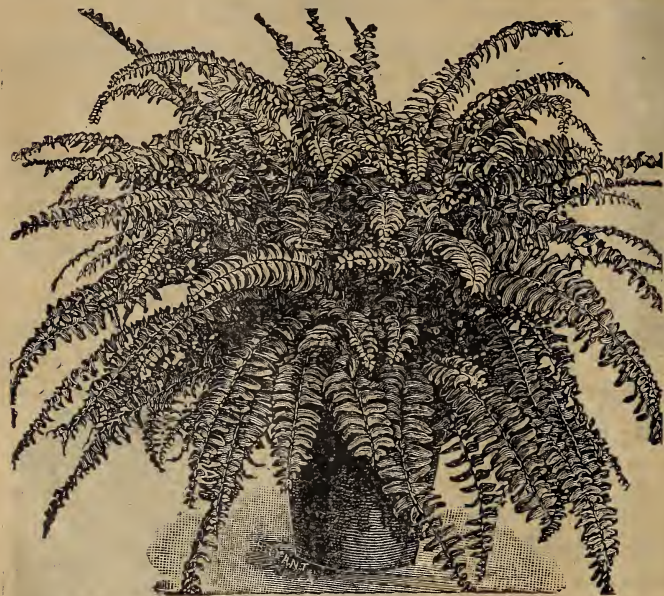
Boston or Fountain Fern.

It is a sport from Scotti , possessing the merits of that most popular variety, but with the pinnae subdivided, giving it an airy, feathery appearance. The fronds, like in Scotti , stand erect, with a graceful arch forming a plant of ideal shape, and they never break down. The smallest plants perfectly express the type, and in every size are models of beauty for table decoration.