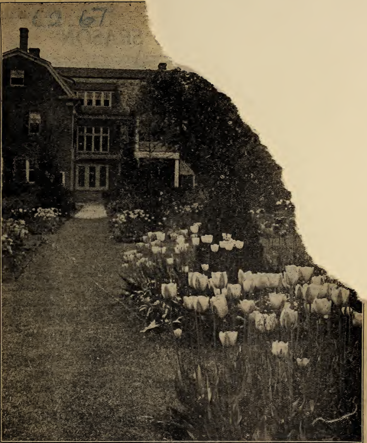
DARWIN TULIPS (See page 8)