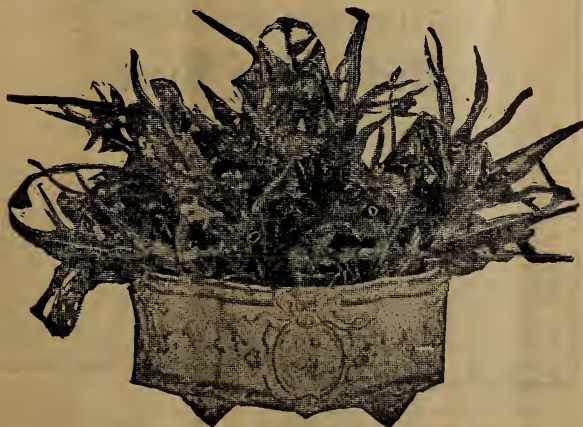
A Fern Dish Collection.

Pteris Wimsetti Green leaves with the ends very peculiarly twisted. Is one of the best varieties for Fern dishes, being a short, compact grower. Will stand much rough treatment.