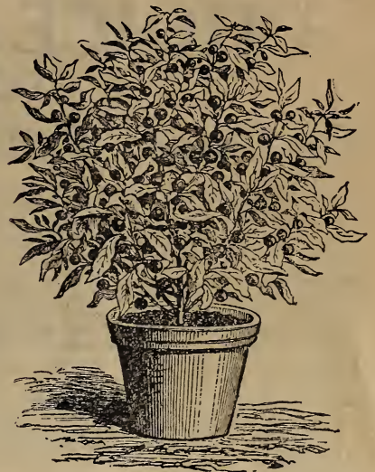
Solanum (Jerusalem Cherry).