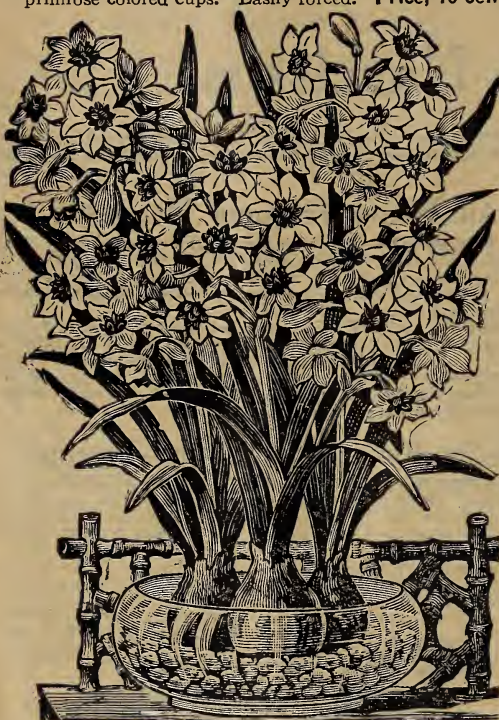
Narcissus—Grand Soliel d'Or.

GLORIOSA —This is an extra fine variety, has immense trusses of pure white flowers with primrose colored cups. Easily forced. Price, 10 cents each: six for 50 cents.