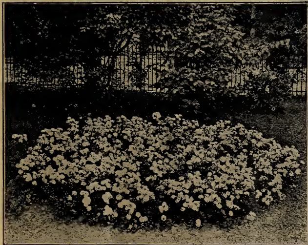
A Sample Bed of Our Twelve Special Favorites in Hardy Ever-blooming Roses for Fall Planting in the Southland.

New Climbing American Beauty—Lady Plymouth—Ball of Snow—Champion of the World—Clothilde Soupert—Maman Cochet—Meteor—Red Letter Day—Rhea Reid—White Maman Cochet—Yellow Maman Cochet—Etoile de France.