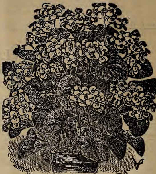
Gloire de Chatellaine.

Coralline Lucerne The Wonderful New Flowering Begonia. This new Begonia has simply taken everybody who has seen it by storm. It certainly is a wonder. The blooms last from a month to six weeks, and are borne in immense clusters, almost hiding the plant. The color is bright coral-red, changing to a delicate pink. It is past the power of speech to describe it. A wonder. Fine plants, 30c.