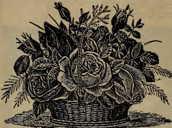
Basket of Roses cut from one of our "Imperia" Collections

WE WILL SEND TWO DIFFERENT VARIETIES OF LARGE TWO-YEAR-OLD ROSES FOR 65 CENTS