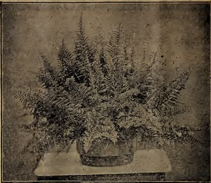
New Fern Verona.

Parlor Fern ( Nephrolepis Elegantissima Compacta )—Dwarf form of N. Elegantissima , making dense, bushy, compact masses of foliage. One of the most valuable Ferns.