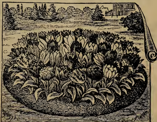
Bed of Fifty Mixed Tulips.

IF BULBS OR PLANTS GO BY EXPRESS, NOT PREPAID, YOU MAY SELECT 10 CENTS EXTRA FOR EACH $1.00.