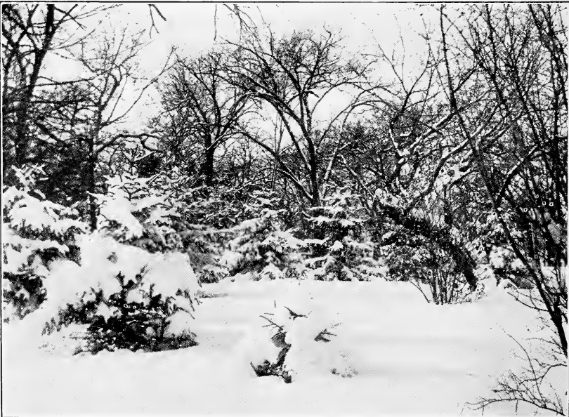
"Black Hill Spruce in Winter—Valley City Park"

What about every family in the North having such a bed in their back yard? Could any ornament be prettier, or any planting more attractive? Is there anything that could be put on the family table that would add more pleasure than a dish of fresh, ripe strawberries, picked from the home garden every day for three months of summer?"