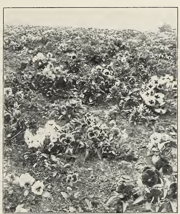
Mastodon Pansy Seed Made in Oregon, U. S. A.