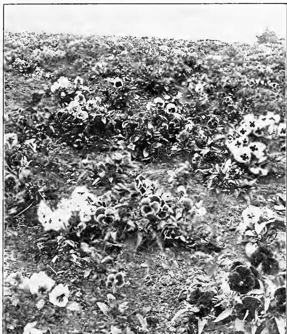
Mastodon Pansy Seed Made in Oregon, U. S. A.