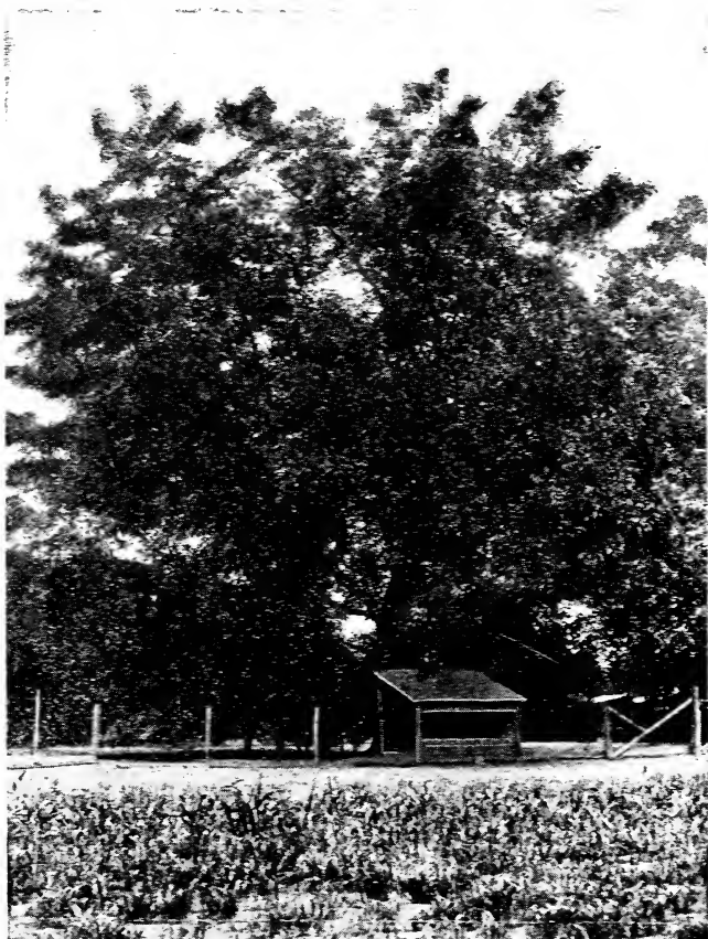
A Tree with a Record. Ask for It.