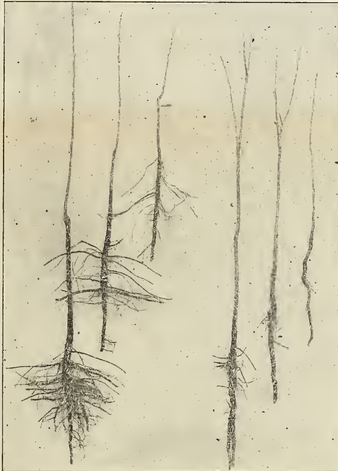
The Root System We Grow. The Kind of Roots usually grown.

The kind of tree you buy is your foundation. Buy the best.