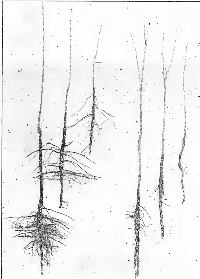
The Root System We Grow. The Kind of Roots usually grown.

The kind of tree you buy is your foundation. Buy the best.