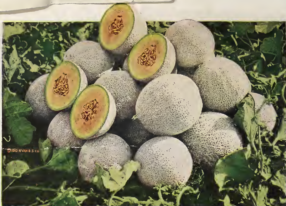
A Color Cut Made from a Photograph Taken in the Field