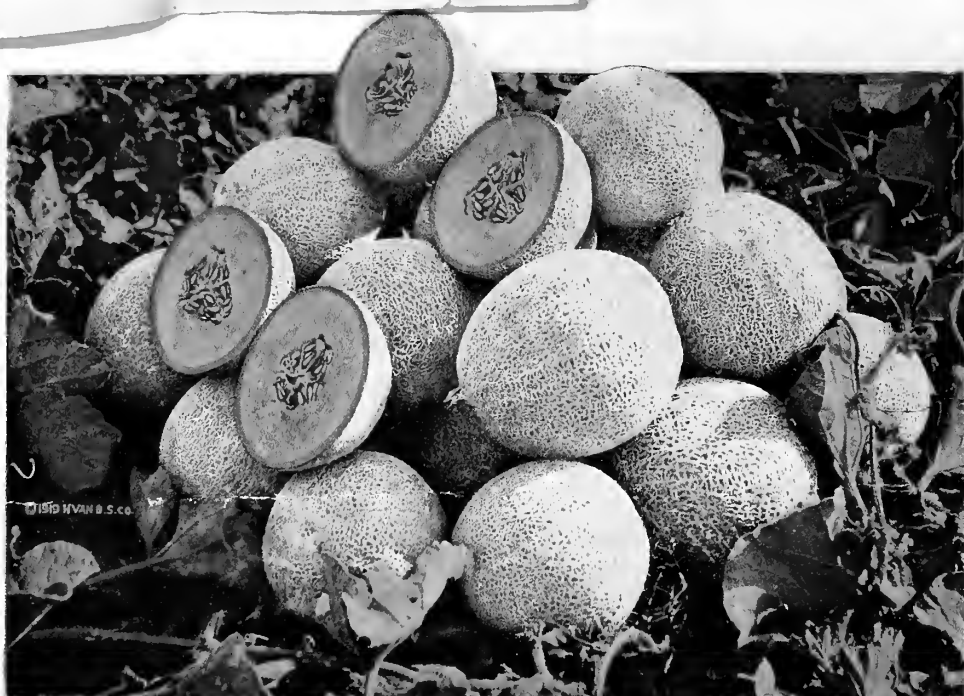
A Color Cut Made from a Photograph Taken in the Field