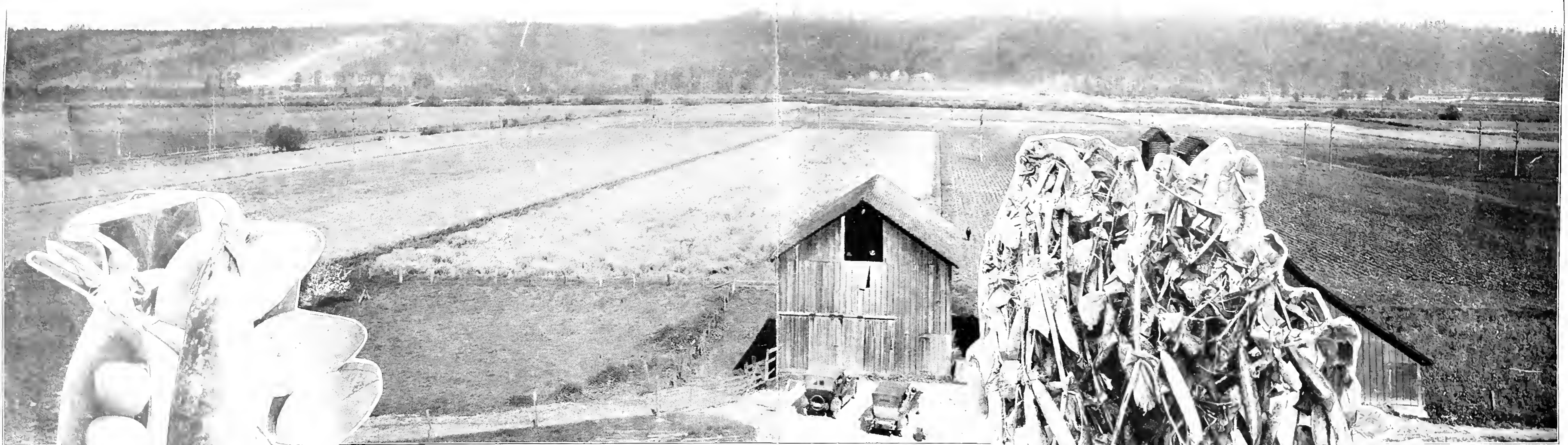
Woodruff-Boyce Summer Ranch—Summer of 1919