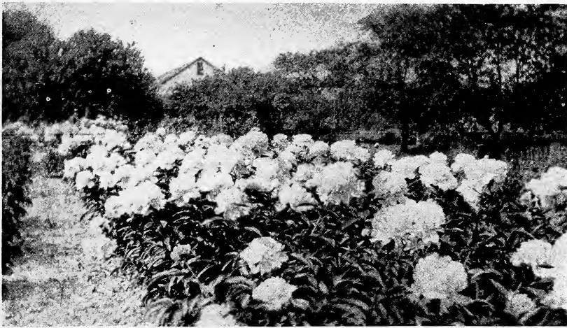
A ROW OF PRIZE WINNING FESTIVA MAXIMA