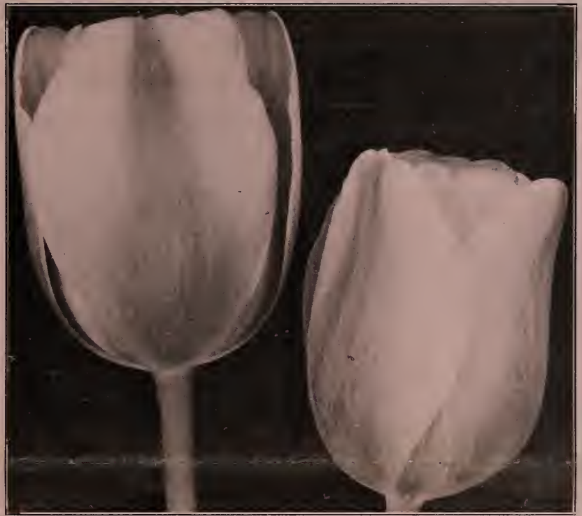
large broad petaled flower of perfect shape; gigantic, dazzling, lasting. Doz., 80c; 25 for $1.50; 100 for $5.50.

75. Farncombe Sanders. Red that is red; fiery rose-scarlet; inside vivid cerise-scarlet;