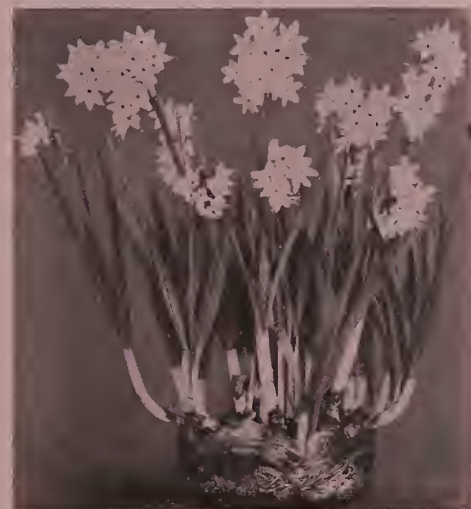
Narcissus That Blooms in Water

For indoors only. Will bloom in soil or water. Usually put in dish or bowl with small stones and water, treated same as the well-known Chinese lily. Is now used in place of Chinese lily by many, as it is more certain to bloom.