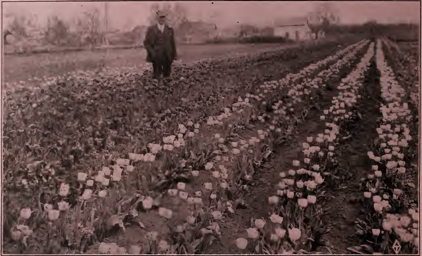
LONG'S Giant Darwin Tulips, Boulder, Colorado