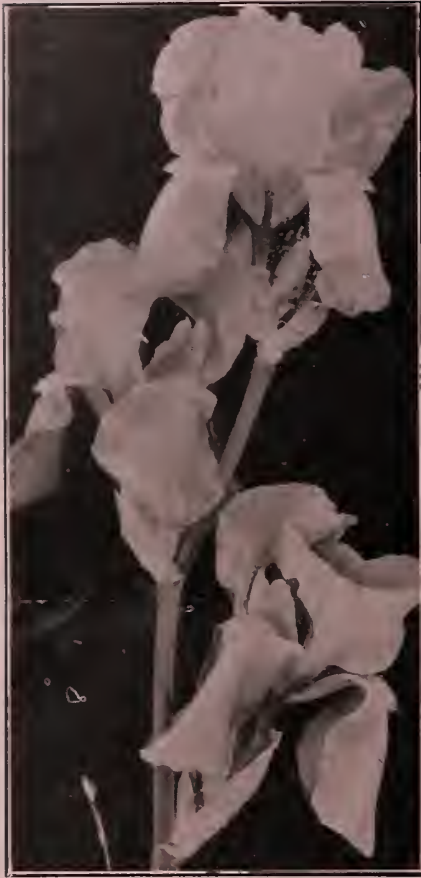
Giant Lavender from LONG'S Garden

"The exquisite beauty of the iris, with its soft and iridescent coloring, is rivaled only by the orchid," so the saying goes. But I would add,—and the gladiolus." The iris comes and goes before the gladiolus appears, so there is no rivalry.