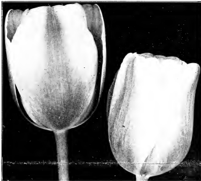
large broad petaled flower of perfect shape; gigantic, dazzling, lasting. Doz., 80c; 25 for $1.50; 100 for $5.50.

75. Farncombe Sanders. Red that is red; fiery rose-scarlet; inside vivid cerise-scarlet;