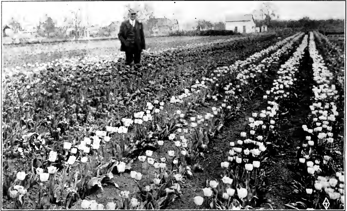
LONG'S Giant Darwin Tulips, Boulder, Colorado