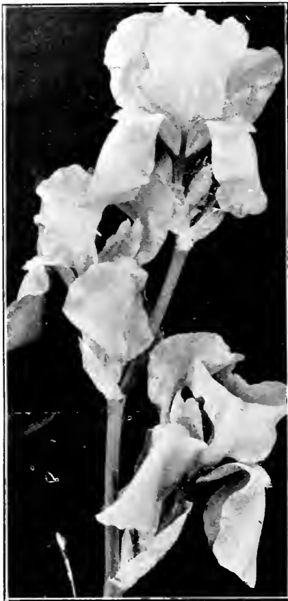
Giant Lavender from LONG'S Garden

"The exquisite beauty of the iris, with its soft and iridescent coloring, is rivaled only by the orchid," so the saying goes. But I would add,—and the gladiolus." The iris comes and goes before the gladiolus appears, so there is no rivalry.