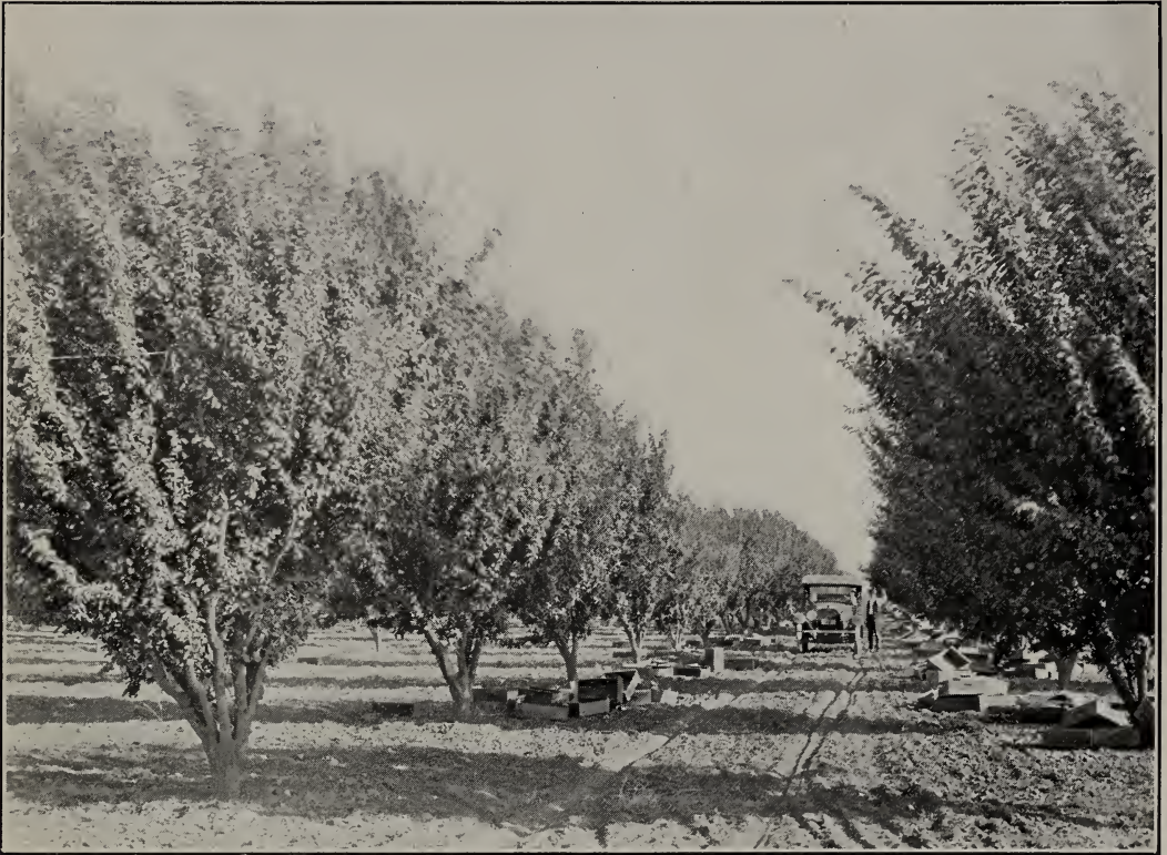
Six Year Old Santa Rosa Plum Orchard in Madera County. Crop this year brought over $1000.00 per acre.

In order that our trees will be suitable for planting in different soils and under various climatic conditions our trees are budded on the Myrobolan and Peach seedlings. We are fortunate in still having a surplus in the varieties as listed herein.