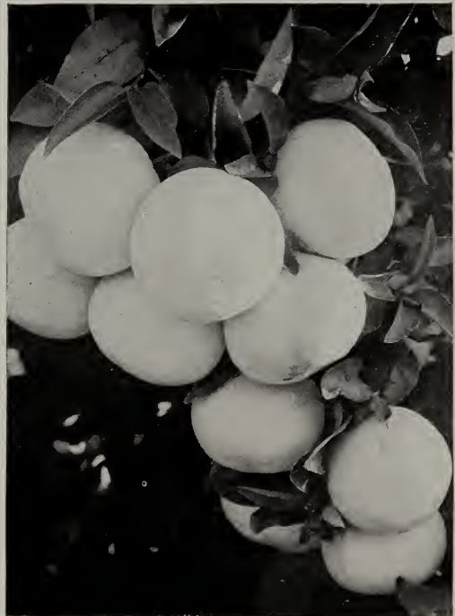
Marsh Seedless Pomelo

Marsh Seedless Pomelo. This variety is well named for it is parctically seedless. The fruits are large, round, rind thin lemon yellow, rich, juicy and of the highest quality.