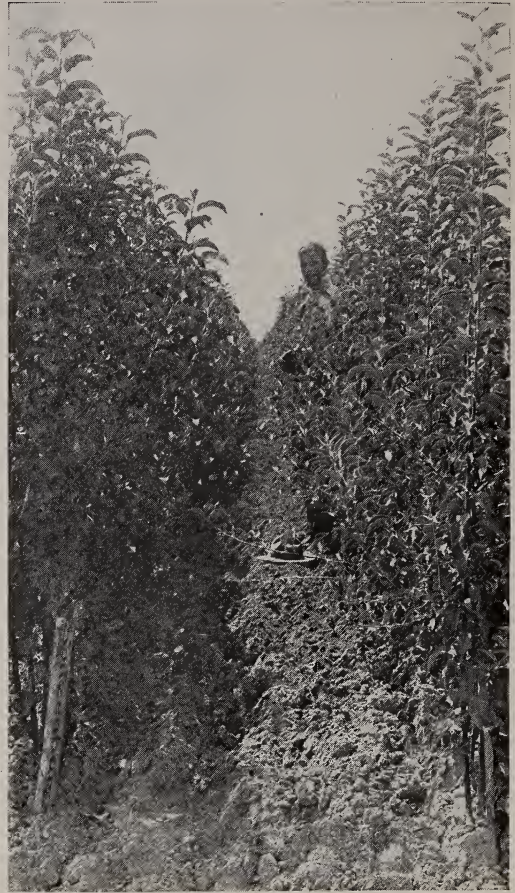
Block One Year Apple Buds in Our Nursery.

Yellow Newton Pippin. A favorite in California. Medium size, juicy, crisp and of high delicious flavor—December to May.