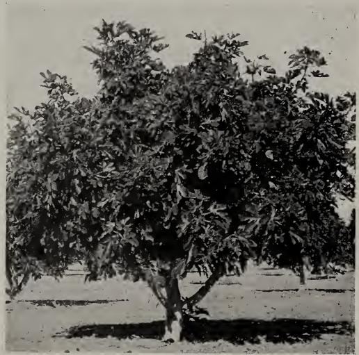
A Properly Pruned 4 Year Old White Adriatic Fig Tree.

Because of its superiority as a canning and preserving fig as well as a good variety for fresh shipment it is becoming more popular each year. Medium size, skin yellow, pulp white. First week in August.