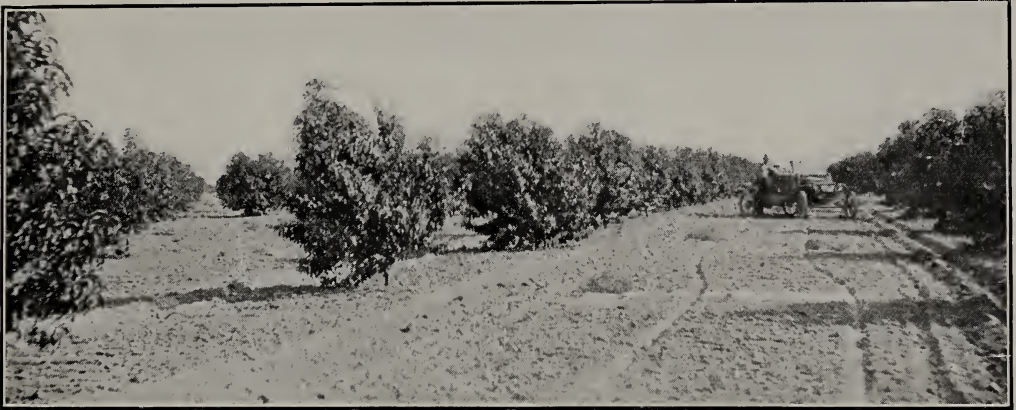
Two Year Old Peach Orchard in the Salt River Valley—Arizona.

We are fortunate this season in having a fine lot of one year trees also June Bud stock to offer. On account of the extreme demand for peaches especially of the leading commercial sorts and the apparent shortage we propagated Double Dormant Budded Seedlings and we call your attention to our "Announcement" on pages one and two which gives full information about this stock.