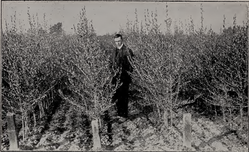
Two Year Old Mission Olive Trees in Nursery Row.

Our stock is growing in Southern California under the most favorable soil and climatic conditions. The trees are sturdy and have fine, smooth bodies. We can make very attractive prices to planters who intend planting on a large scale.