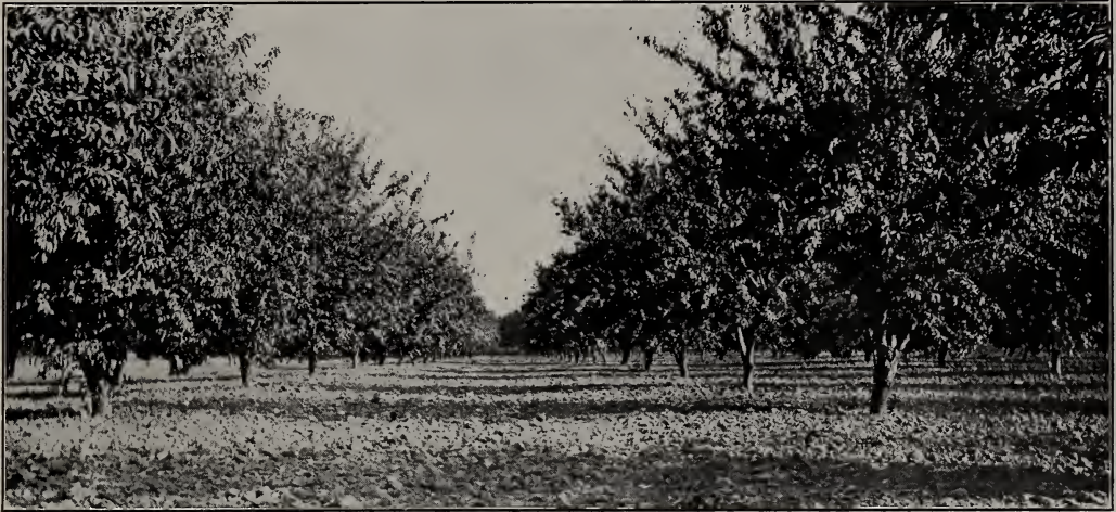
Four Year Old Almond Orchard in the Sacramento Valley.