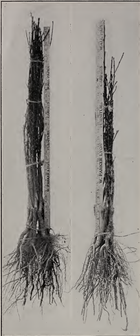
Number One Number Two June Budded Peach Trees.

Peak's Cling. In size and shape it resembles the Phillip's Cling. Texture firm and clear yellow to the pit. Valued as it ripens between the Tuscan and Phillip's Cling—August.