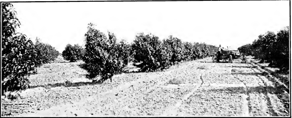
Two Year Old Peach Orchard in the Salt River Valley—Arizona.

We are fortunate this season in having a fine lot of one year trees also June Bud stock to offer. On account of the extreme demand for peaches especially of the leading commercial sorts and the apparent shortage we propagated Double Dormant Budded Seedlings and we call your attention to our "Announcement" on pages one and two which gives full information about this stock.