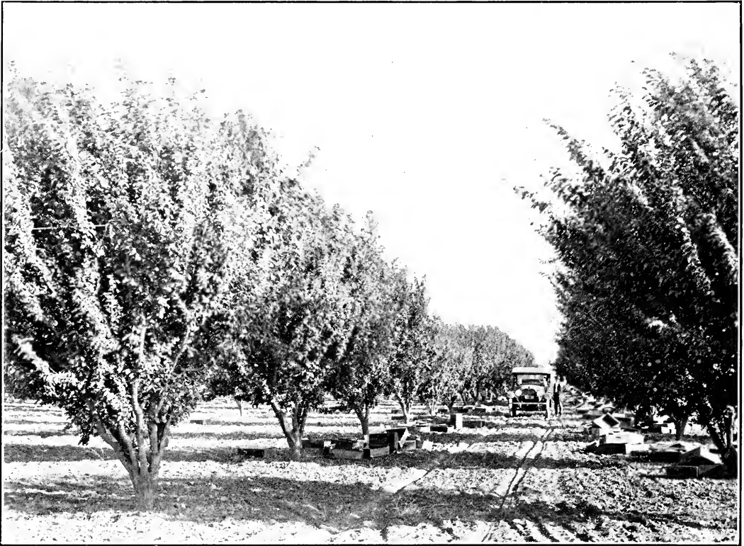
Six Year Old Santa Rosa Plum Orchard in Madera County. Crop this year brought over $1000.00 per acre.

In order that our trees will be suitable for planting in different soils and under various climatic conditions our trees are budded on the Myrobolan and Peach seedlings. We are fortunate in still having a surplus in the varieties as listed herein.