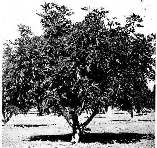
A Properly Pruned 4 Year Old White Adriatic Fig Tree.

Because of its superiority as a canning and preserving fig as well as a good variety for fresh shipment it is becoming more popular each year. Medium size, skin yellow, pulp white. First week in August.