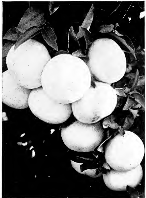
Marsh Seedless Pomelo

Marsh Seedless Pomelo. This variety is well named for it is practically seedless. The fruits are large, round, rind thin lemon yellow, rich, juicy and of the highest quality.