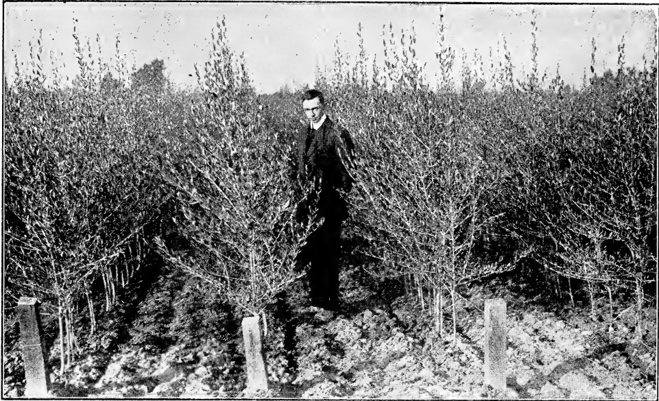
Two Year Old Mission Olive Trees in Nursery Row.

Our stock is growing in Southern California under the most favorable soil and climatic conditions. The trees are sturdy and have fine, smooth bodies. We can make very attractive prices to planters who intend planting on a large scale.