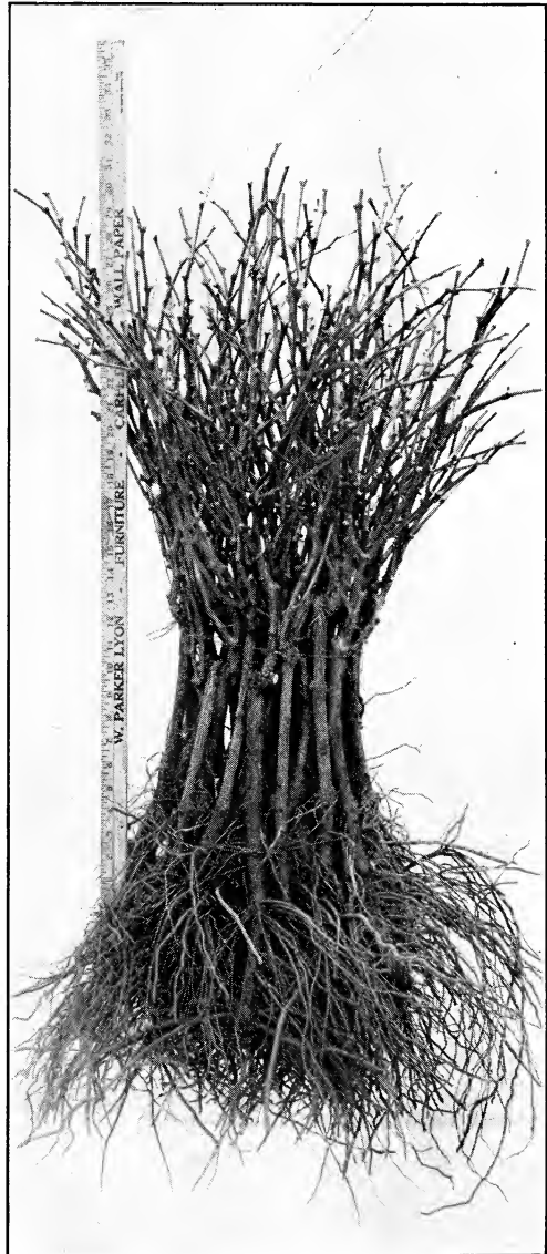
Number 1 Thompson Seedless Rootings.

Thompson Seedless. The well known seedless raisin grape, bunches large, long and often shouldered, berries are oval, greenish yellow and larger than Sultana. Thin skin and of good flavor. The vine is a rampant grower and an unusually heavy bearer. Adapts itself to a wide range of soils including that which is somewhat impregnated with alkali—August.