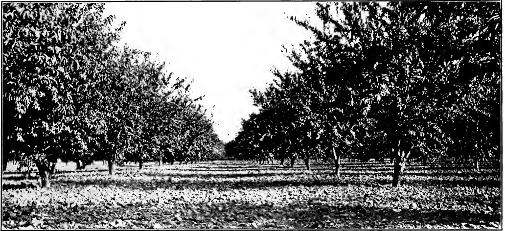
Four Year Old Almond Orchard in the Sacramento Valley.