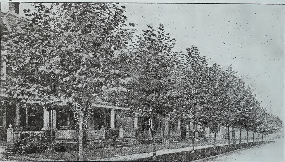
Avenue of Oriental Planes (see page 2)