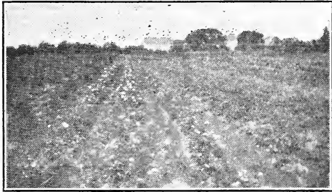
The Baby Rambler Roses are not only in bloom, but are covered with flowers from June to frost.

be cut even more severely. From Lombardy Poplars, remove fully one-half of each young branch. In all cases, prune at once after the stock has been planted.