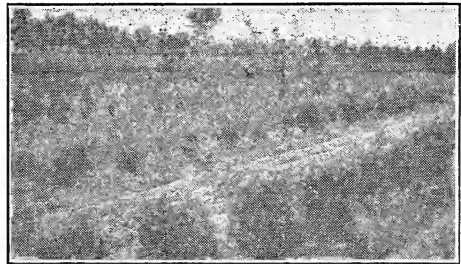
The Thuya Hoveyi is one of the most useful of the dwarf Evergreens.

Evergreens when being transplanted, require no pruning, but deciduous shrubs and vines should, with a few exceptions, be cut back at once after planting, and in order to induce a healthy and bushy growth, it is generally best to remove fully one third of each branch. Hybrid and Climbing Roses, however, after first being set very deeply, should be cut back to within 4 to 6 inches of the ground. Grapevines, like roses, require deep planting and close pruning.