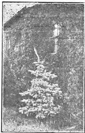
A well-grown specimen of Koster's Blue Spruce is always interesting.

Flowering Shrubs, Shade Trees, Vines, Hedgeplants, Fruit-trees, and Small Fruits, are in condition for transplanting at any time after September 15. There are, however, a few exceptions from this general rule, and unless protection can be given the trees and plants during the first winter, the following named varieties should not be transplanted in the Autumn. The reason is not altogether that they are questionably hardy when well established, but rather because they are slow in becoming re-established after being transplanted, and are therefore, most successfully moved in early Spring, or as soon as possible after the frost is out of the ground.