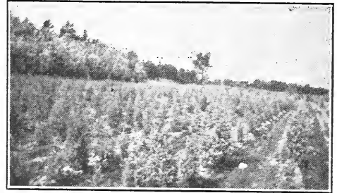
Block of Red Cedars.

Roses. After planting, and before water is applied, have the earth pressed firmly about the roots.