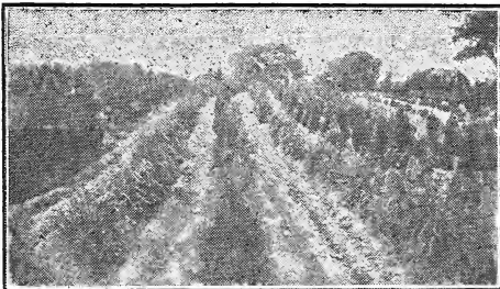
Block of Hemlocks

For covering large tracts or barren hillsides, use the Red Cedars, Scotch, Austrian, Red and White Pines, the Colorado, White and Norway Spruces, the Douglas Fir and the Canadian Hemlock. Planting of the above may be commenced at any time after August first.