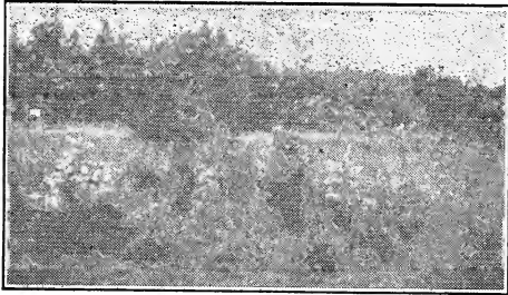
A bed made of Dwarf Evergreens is always attractive.

Plan now for your Autumn Planting. Use liberally of the Evergreens as they are equally attractive in Winter, as during the Summer, and further, because they require practically no attention after once they become established. For coarse screens or wind-breaks, use the White or Red Pines, Norway Spruce and Hemlocks.