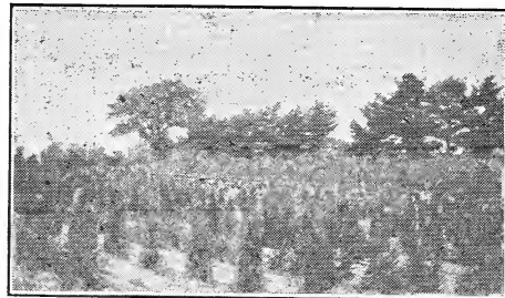
Block of Hemlocks and Pyramidal Arbor Vitae.

York from August first until the ground is frozen.