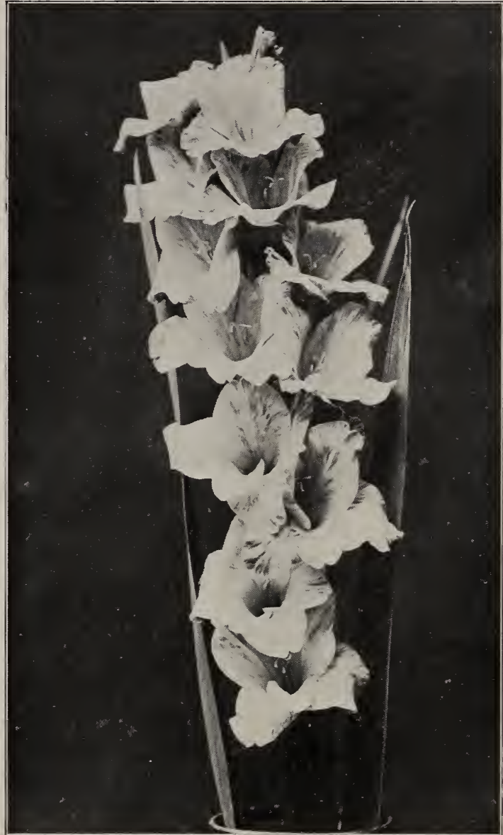
No. 416 HELEN PHIPPS