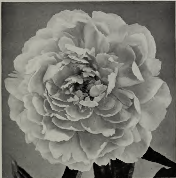
Martha Bulloch (See page 28)

reached me in perfect condition. This Spring, although their first year, they all flowered, having blossoms much finer than I had any right to expect on plants not yet established."