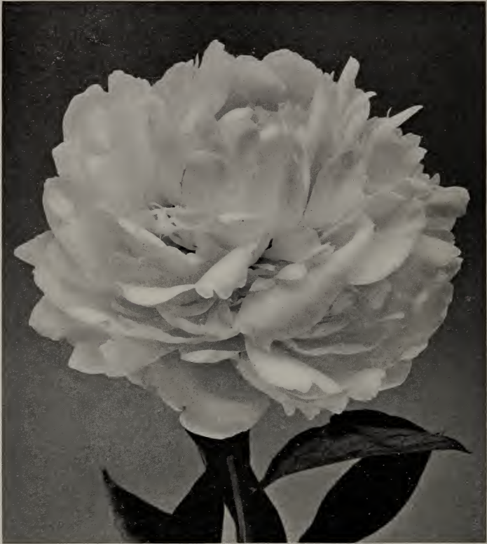
Frances Willard (See page 28)