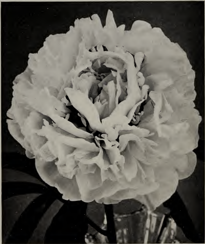
Madame Jules Dessert (See page 28)

A heavy mulching, having to some extent the same effect as a deep planting, will often be followed by blind growths or buds which fail to develop. (See "Why Some Peonies Do Not Bloom.")