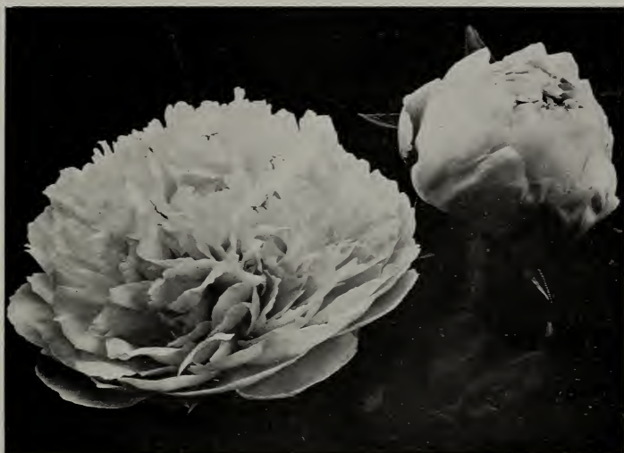
Couronne d'Or (See page 22)