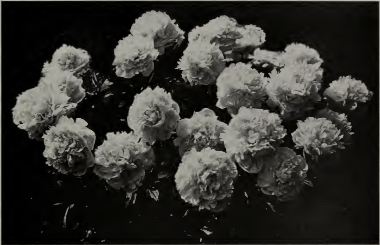
Just one Plant of Avalanche (See page 25)