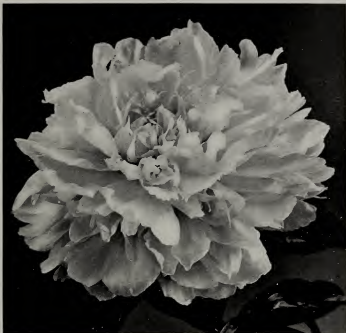
Jubilee (See page 28)