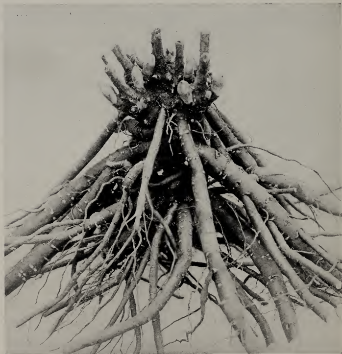
A Dormant Peony Root as it appears in the Fall

The Peony is sent out in the form of a root (see cut below), from which, when dormant, will be seen protruding pinkish "eyes" or buds, the strongest of which will throw up next season's flowering shoots.