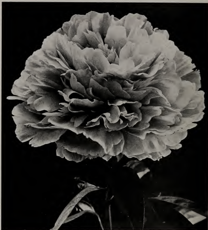
Mad. de Galhau (See below)

COURONNE D'OR (Crown of Gold). (Calot). Very large and full imbricated flower of superb form. White, reflecting yellow, center petals bordered with carmine; golden stamens showing through and lighting up flower. Solidly and perfectly built from edge to center. Fragrant, a good grower and reliable bloomer. Blooms moderately late, preceding Marie Lemoine. 1—2.