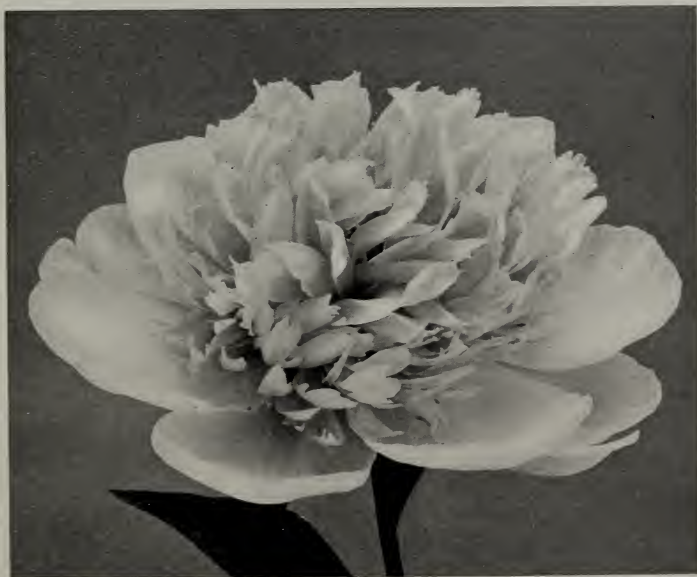
Primevere (See page 29)

If set at once in a cold, dark cellar the different varieties may be kept several days longer than their blooming period. Bring up as wanted.