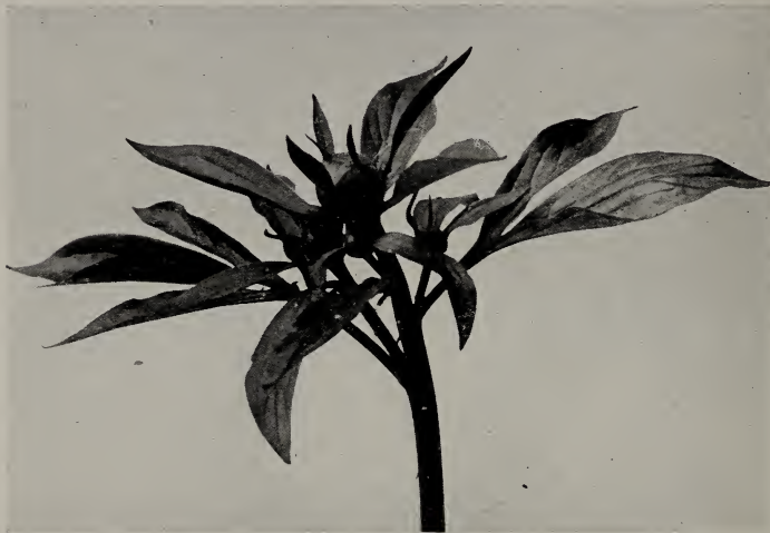
A Peony growth just after buds are formed

Do not let the mere number of eyes claimed influence you, as a weak root with from six to ten small eyes may not flower for several years, while two or three good plump eyes (and most of my smallest size plants will average double this), with strong roots behind them, will flower the first season. Even in one-year stock, I aim to send out only roots which will produce some bloom the first season, if well planted, and this we can invariably do if your order is received fairly early.