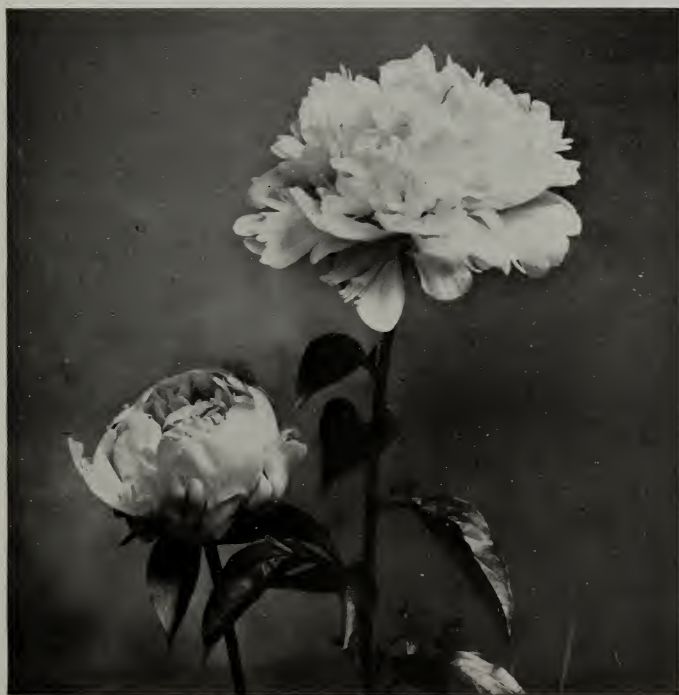
La Tulipe (See page 20)

Discounts, Page 18 Collections, Pages 31-32