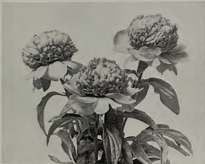
Augustin d'Hour (See page 19)

UMBELLATA ROSEA. (Syn. Sarah Bernhardt.) (Dessert). Broad guard petals, delicate rose-pink. Center petals short, straw-yellow, with tufts of whitish pink. Habit ideal; flowers borne on stiff, upright stems. Fragrance delicate and agreeable. Blooms young and abundantly. The first of the Albiflora sorts to flower; usually in bloom here by Decoration Day. A lovely Peony. 2.