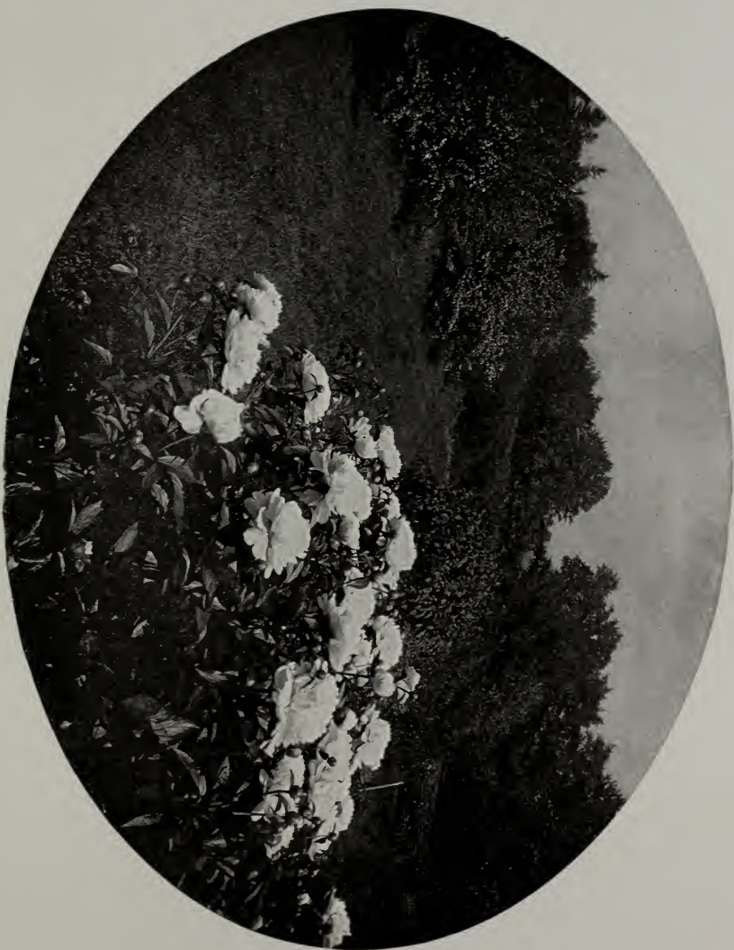
A Clump of Festiva Maxima (See page 22)