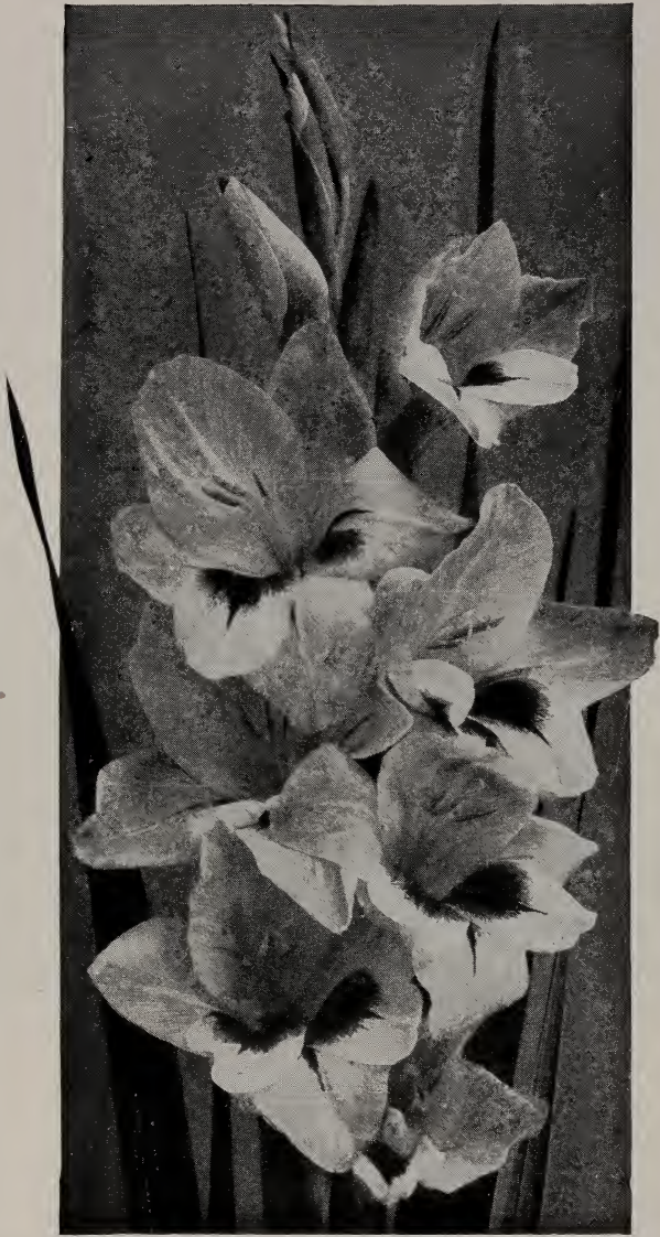
The long flower-spikes of the Gladiolus, Mrs. Frank Pendleton, make it of great value for cutting