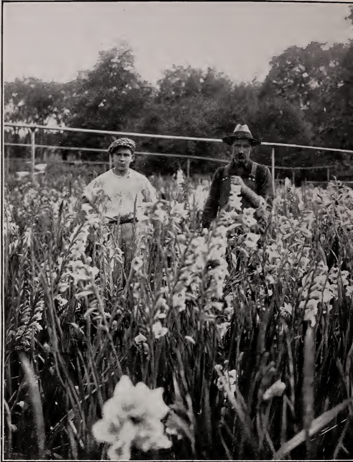
One of the fields of Gladioli as grown