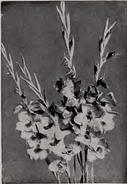
No illustration can picture the stately beauty of an armful of Gladioli