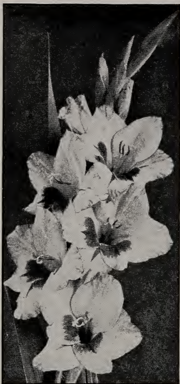
Blooms of delicate colors and distinct markings are possible in every garden, for Gladioli are easily grown.