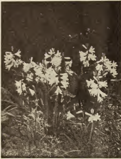
St. Bruno Lily