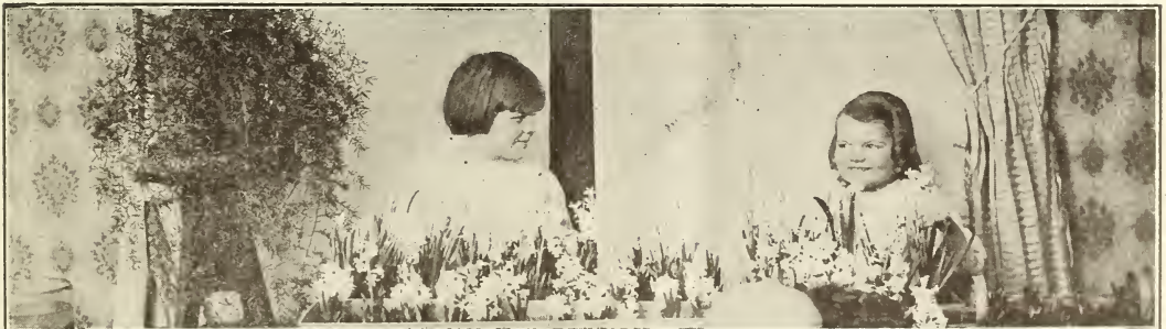
These little tots grew these Jacinth flowers from our bulbs