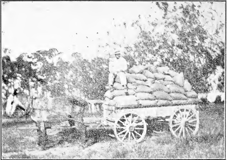
$2,000 LOAD OF PECANS

MEDAL AND DIPLOMA was awarded us at the World's Fair, St. Louis, Missouri.