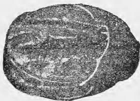
Broken "SUCCESS" Natural Size