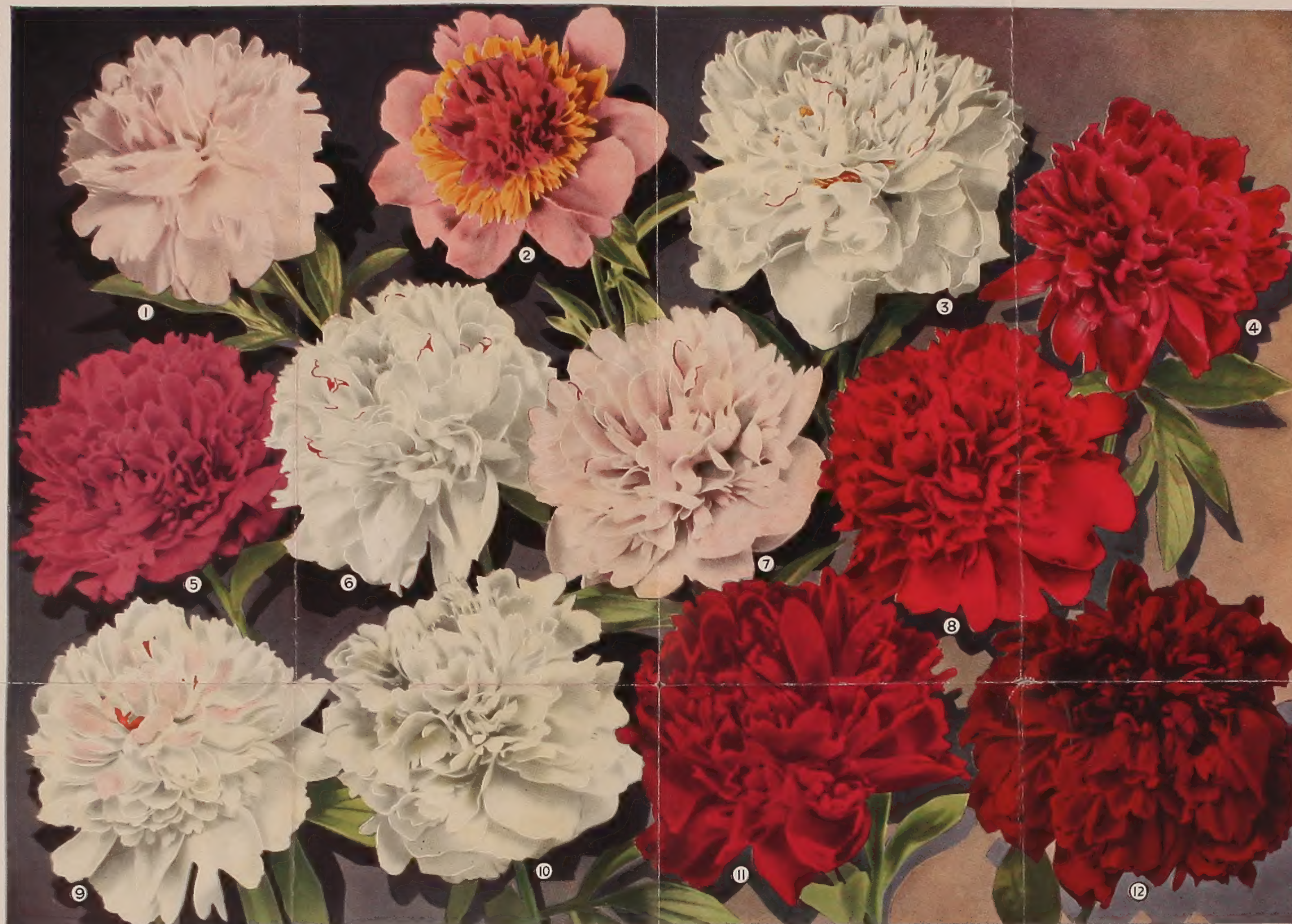
1—Mme. Calot. 2—Philomele. 3—Couronne D'Or. 4—Delachei. 5—Edulis Superba. 6—Festiva Maxima. 7—Mons. Charles Leveque. 8—Felix Crousse. 9—Mme. de Verneville. 10—Duchess de Nemours. 11—Karl Rosenfield. 12—Midnight.