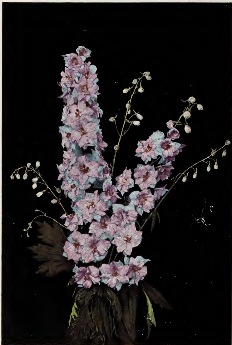
THE BURNS NEW HYBRID DELPHINIUM (SEE DESCRIPTION PAGE 2)