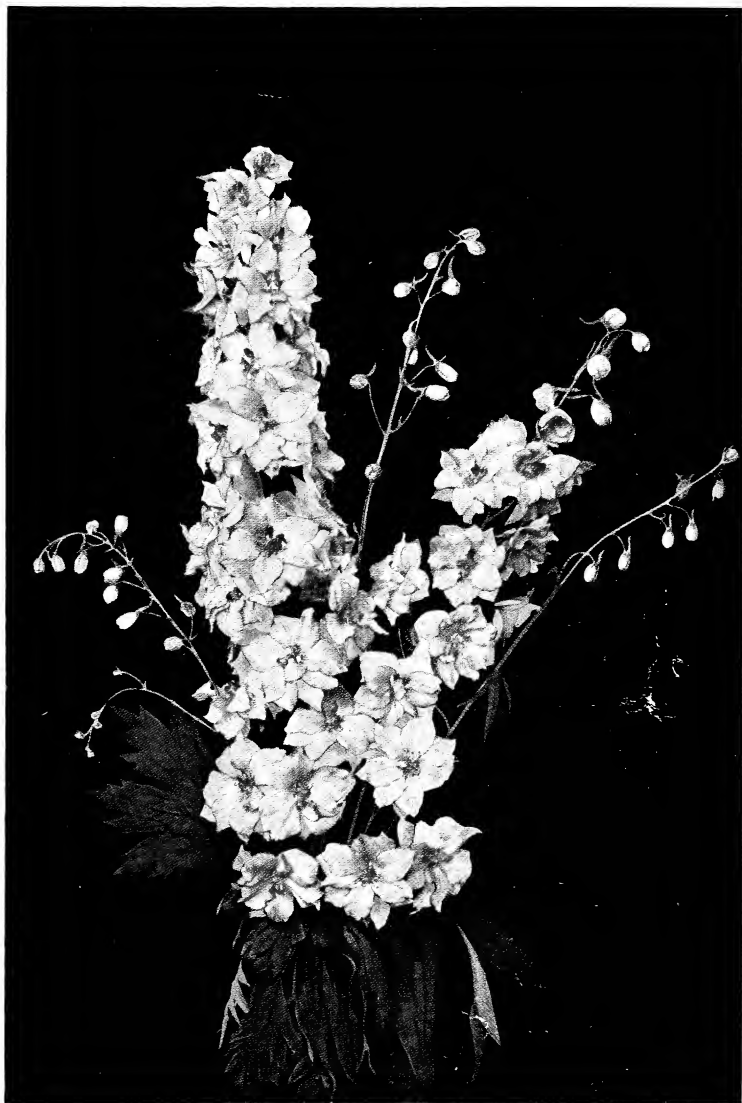
THE BURNS NEW HYBRID DELPHINIUM (SEE DESCRIPTION PAGE 2)