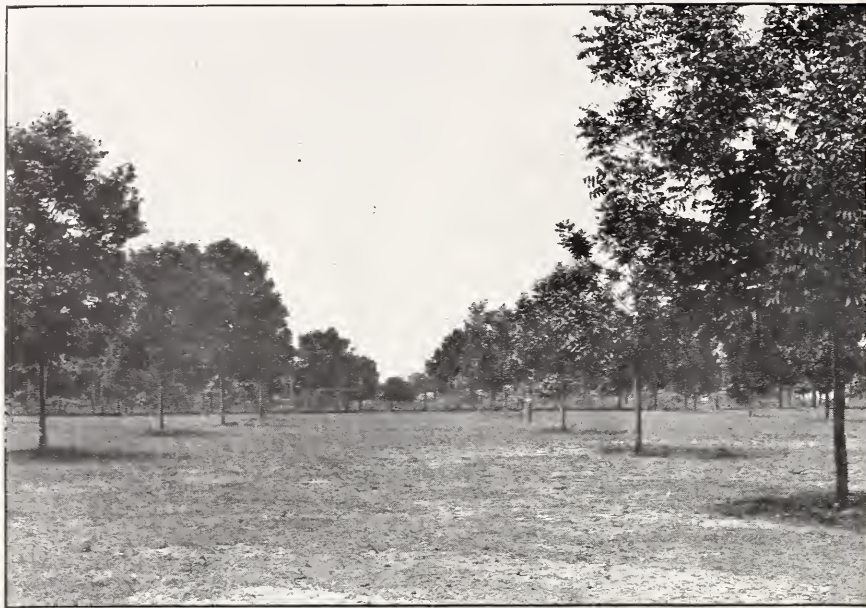
Grove of 6-year trees at Lockhart—located on poultry farm