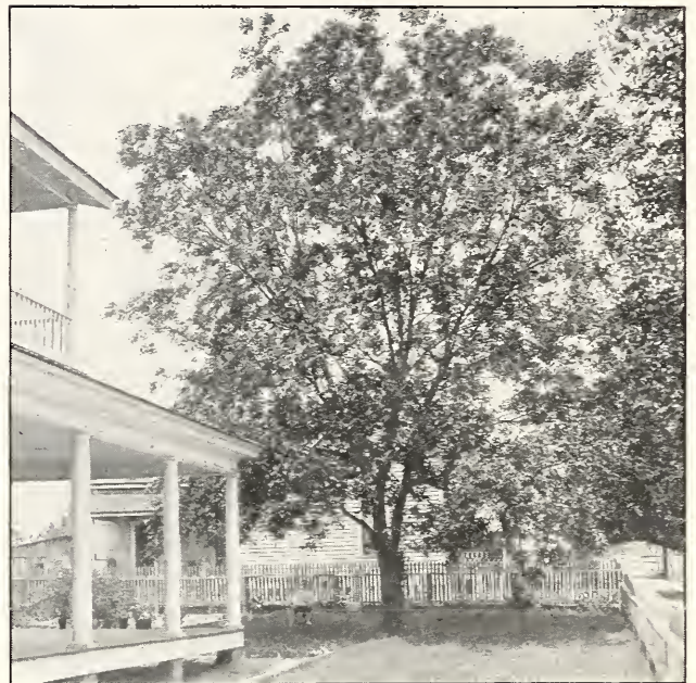
This tree yields 150 to 300 pounds per annum

Although Pecan orchards are being planted each year the demand for nuts is growing