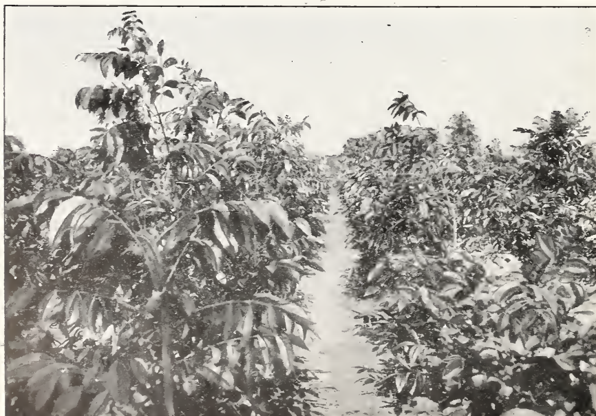
Healthy, clean and vigorous growth—no inferior stock shipped by us

faster than the supply. Each year the prices go a bit higher; each year you delay means less profit to you. Get in touch with us now; tell us about your soil and what size plot you'd like to plant, or place your order on the other side of this folder and send it to us with check or money order.