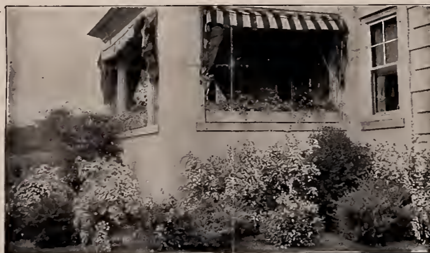
Porch and Foundation Planting

HOWARD LAKE AND VICTOR NURSERIES Howard Lake, Minnesota