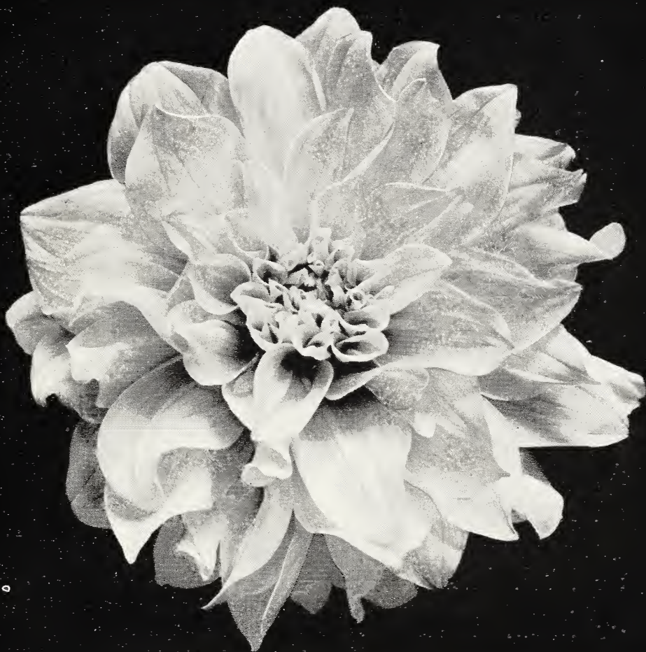
PRISCILLA Decorative Dahlia