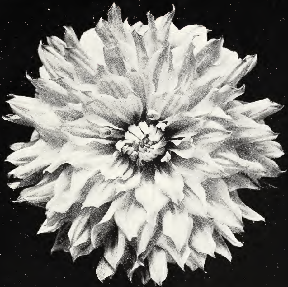
ELENA EYRE New Decorative Dahlia 1922 Introduction