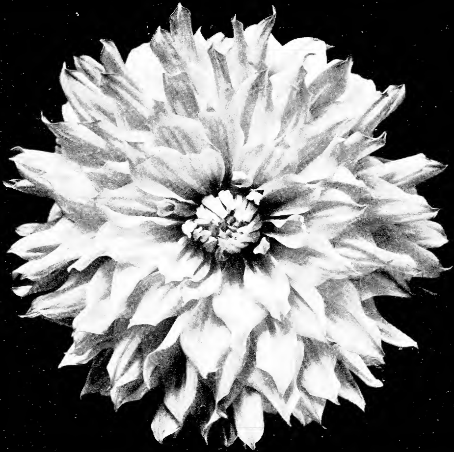
ELENA EYRE New Decorative Dahlia 1922 Introduction