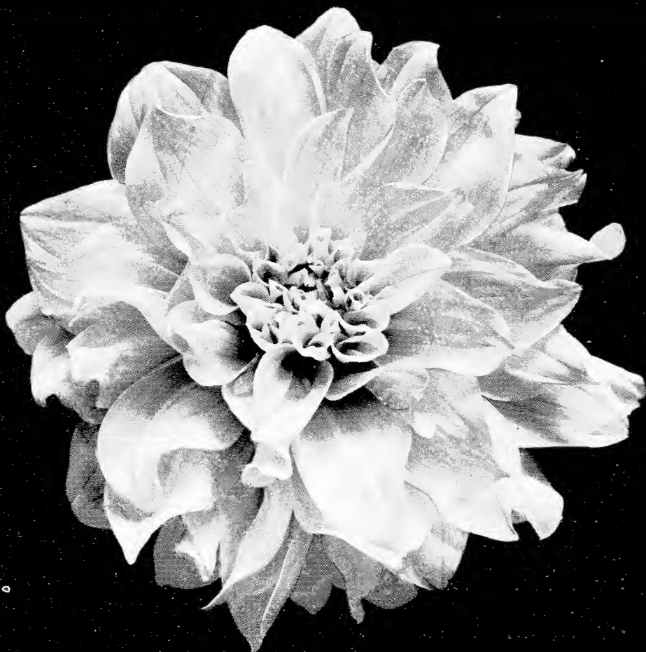
PRISCILLA Decorative Dahlia