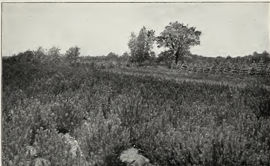
Block of Pinus mughus specimens at Boxford-Highlands Nursery

Deliveries by truck are prompt and safe, and place the specimens at the right spot. The cost is reasonable.