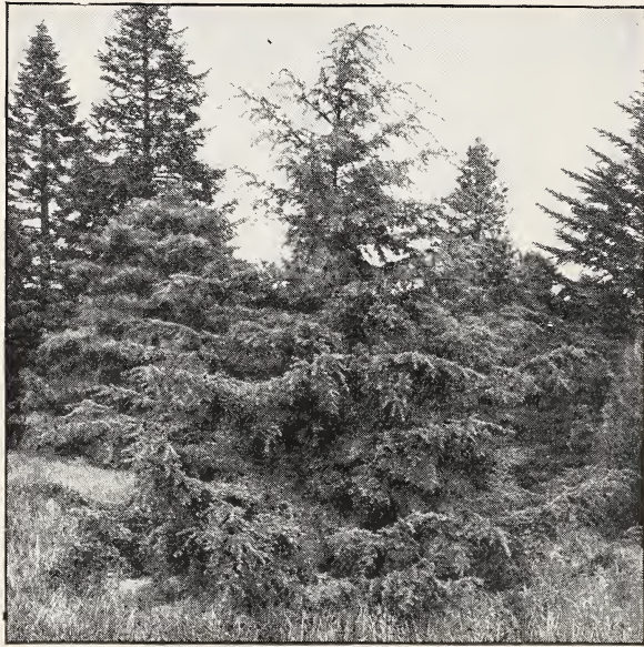
THE CAROLINA HEMLOCK ( Tsuga caroliniana )