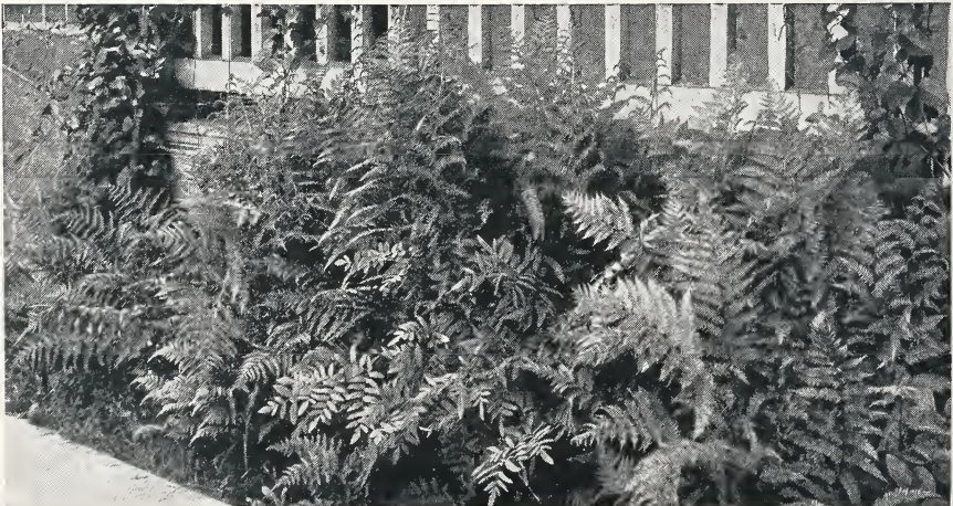
Foundation Planting of Hardy Ferns