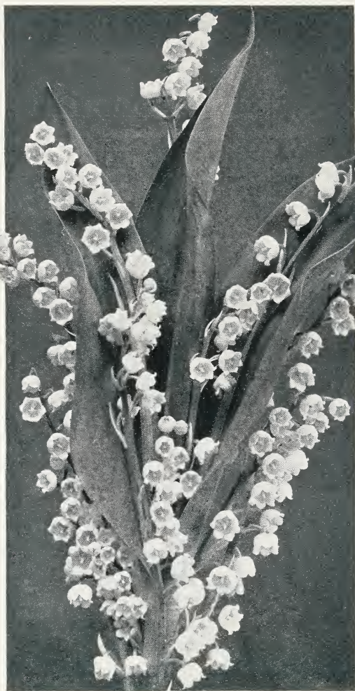
Convallaria majalis (Lily-of-the-Valley)