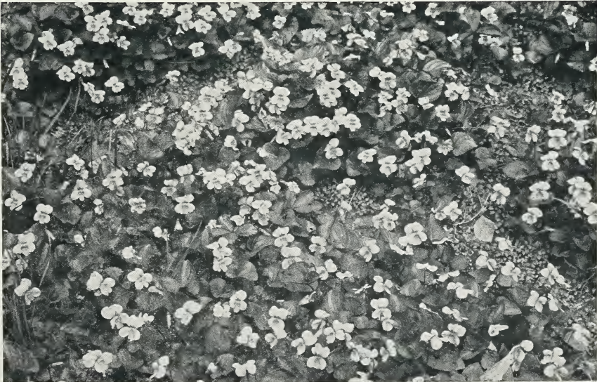
Bed of Violets