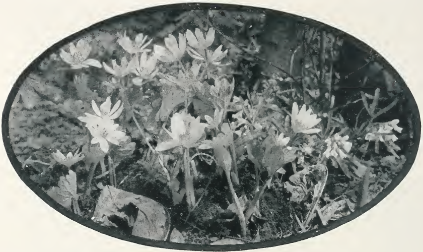
Sanguinaria canadensis (Blood-Root)