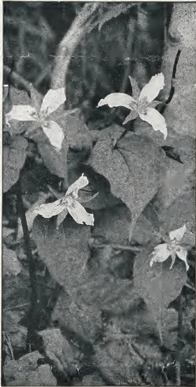
Trillium undulatum. (See page 5)

Thirty years' experience growing and handling Native Ornamentals. Carload shipments solicited for FALL AND NEXT SPRING DELIVERY.