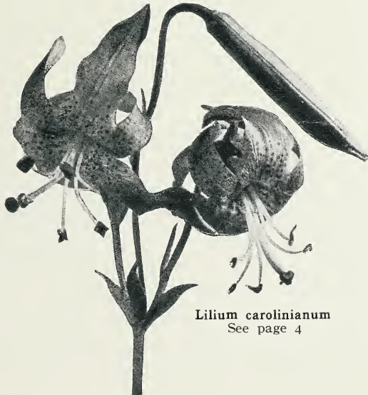
Lilium carolinianum See page 4