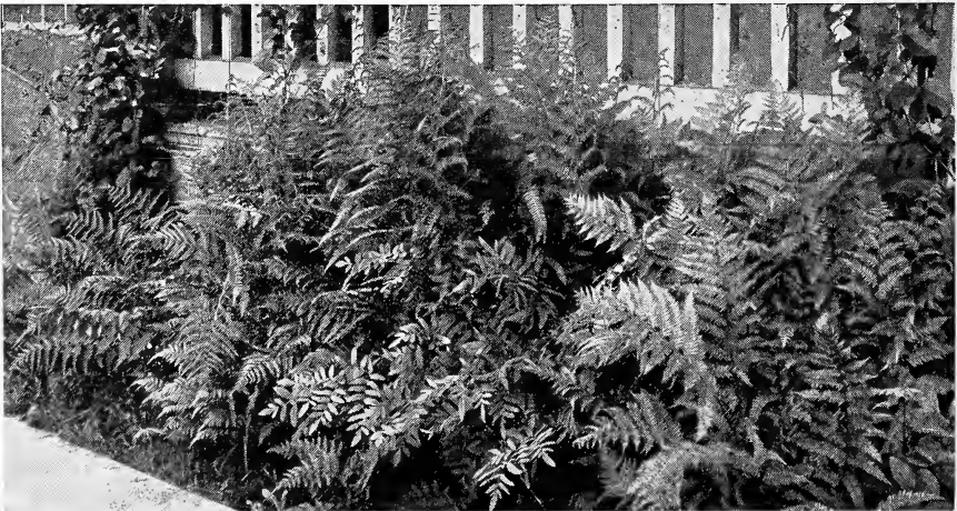
Foundation Planting of Hardy Ferns