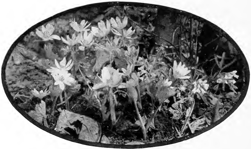
Sanguinaria canadensis (Blood-Root)