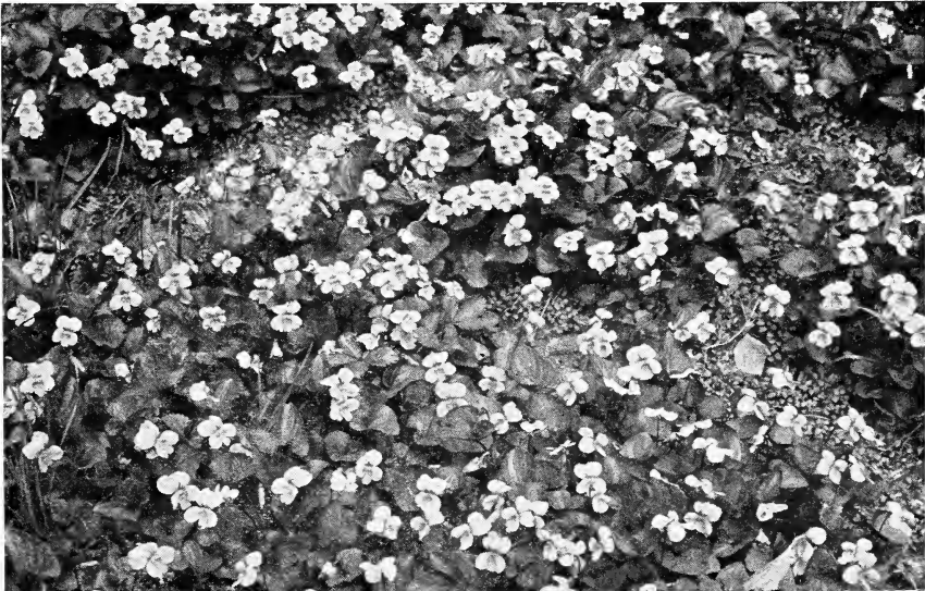
Bed of Violets