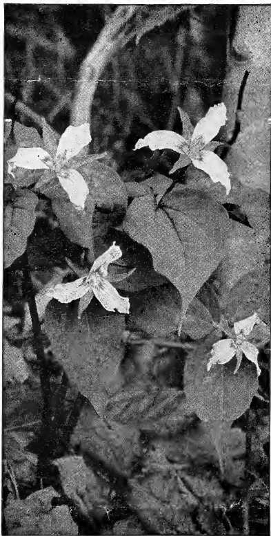
Trillium undulatum. (See page 5)

Thirty years' experience growing and handling Native Ornamentals. Carload shipments solicited for FALL AND NEXT SPRING DELIVERY.