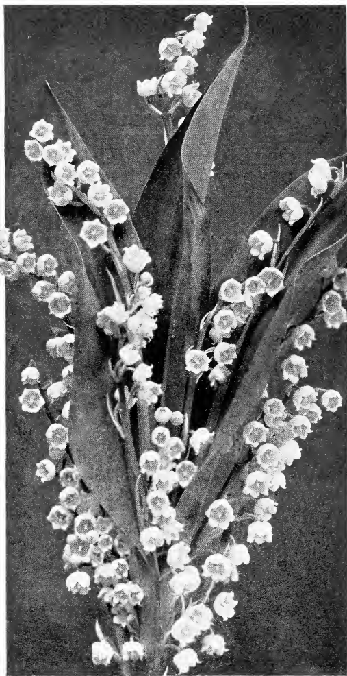
Convallaria majalis (Lily-of-the-Valley)