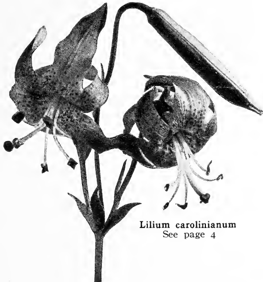
Lilium carolinianum See page 4