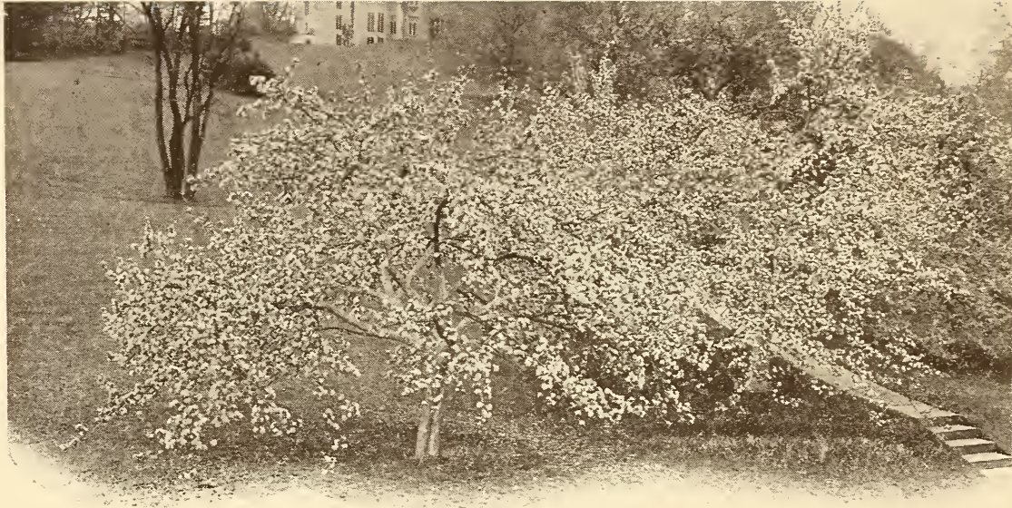
The Flowering Crab-Apple

and sharply toothed; very large, bright red berries.