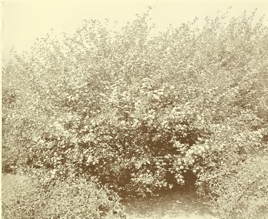
The Cockspur Thorn

Stately, wide-spreading, long-lived shade trees that become majestic specimens with age. A landscape planting is incomplete without some representatives of this noble family. Adaptable to almost any soil, but reach their greatest perfection where the soil is reasonably fertile.