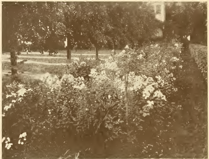
Phlox in a Rose Garden—To Give Color When the Roses Are Through Blooming

stately border plant, with masses of double, golden yellow flowers. 6 to 8 feet. Aug., Sept.