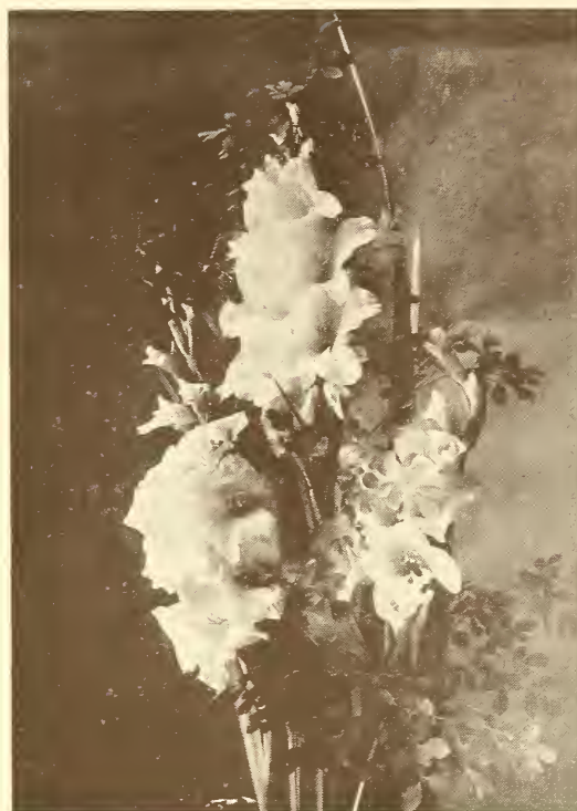
A Gladiolus Favorite