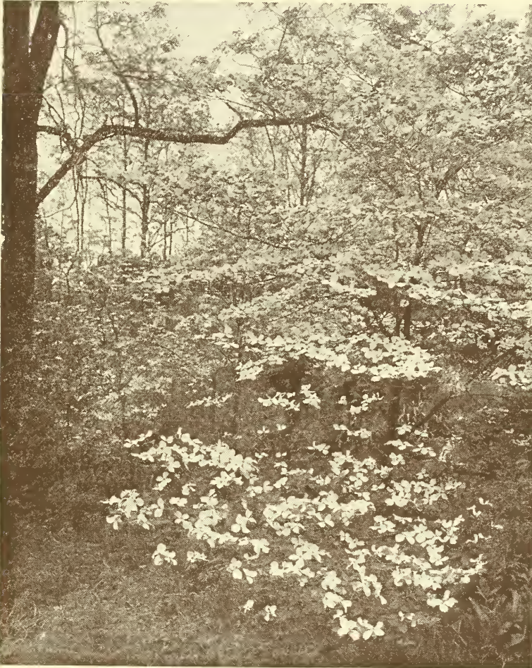
Dogwood in Bloom

glossy. Develops into an imposing spectacle.