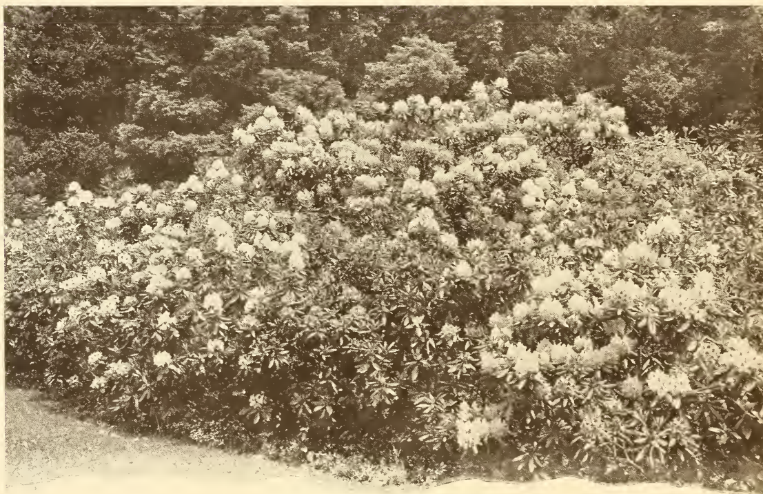
Rhododendrons in Full Splendor