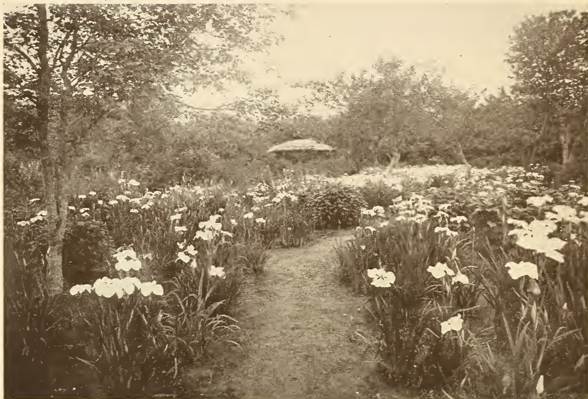
A Mass Planting of Japanese Iris