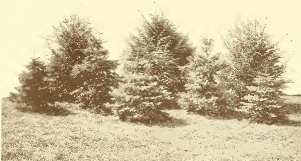
A Group of Koster's Blue Spruce and American Hemlock, Outpost Nurseries