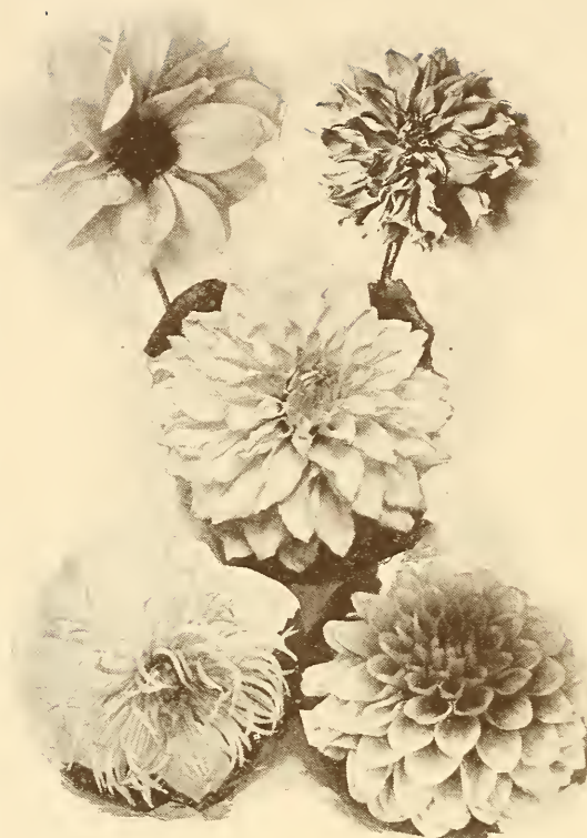
Varieties of Dahlias