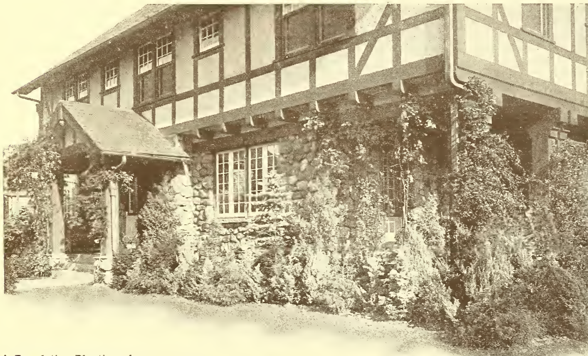
A Foundation Planting of Evergreens Gives a Rich Effect All Year Round

— Pisifera plumosa (Plume-like Cypress). Foliage bright green, in numerous feathery branches. One of the most popular varieties.