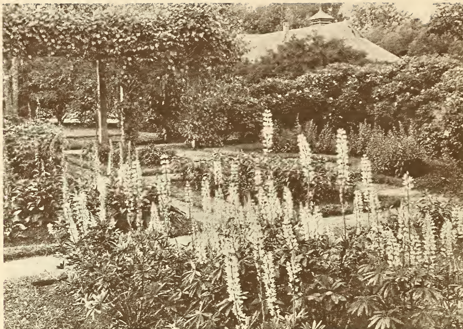
Lupines in the Perennial Garden