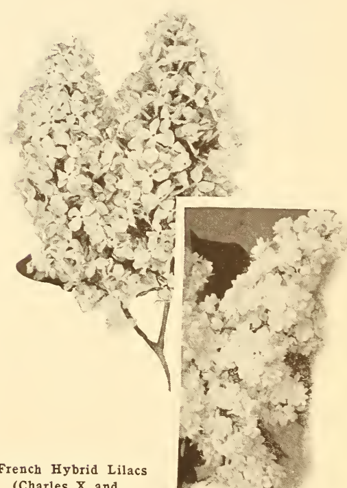
French Hybrid Lilacs (Charles X and Mme. Lemoinei)

—Semperflorens. Erect grower, with nicely cut leaves and large clusters of pretty pink flowers in July and August. Tall. 3 to 4 ft., 50 cts. each, $4.50 for 10.