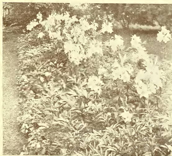
Lilium Candidum Planted Among Peonies for Summer Effect