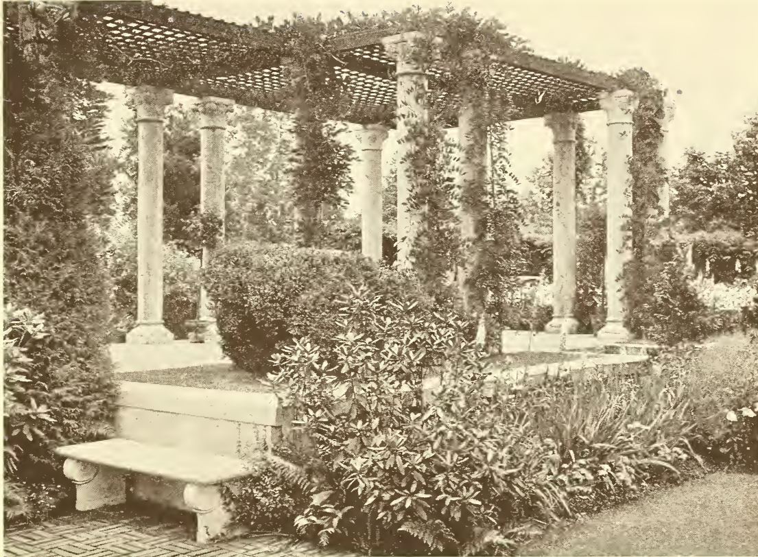
Vines and Pergolas Always Make an Effective Combination