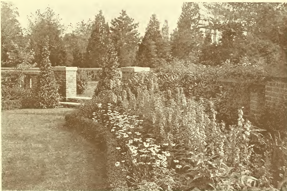
Foxglove in a Perennial Border