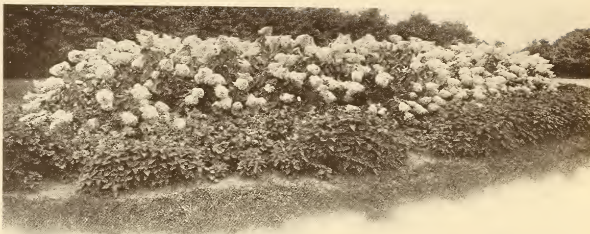
Hydrangea Paniculata Grandiflora in Mass Planting