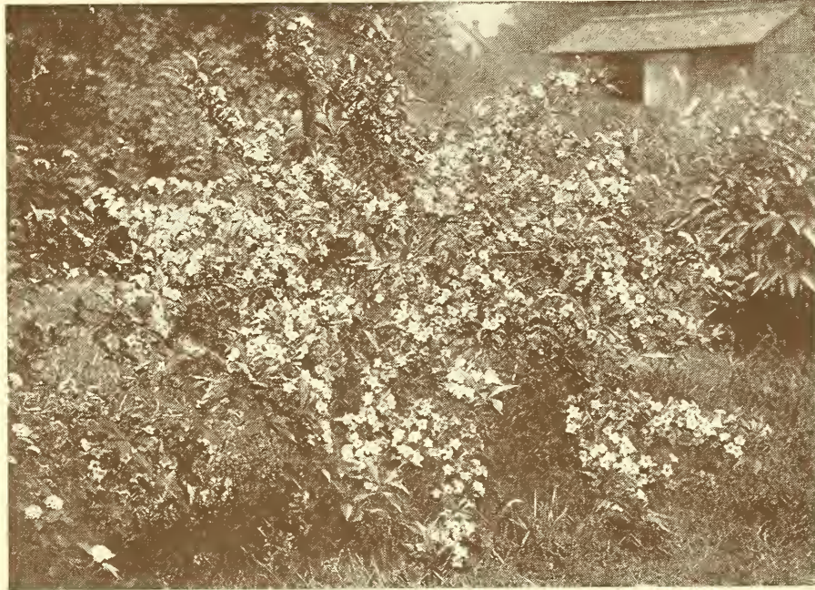
Weigela in the Pink Dress of June

— Vulgaris (Coral Berry). Vigorous and quick grower; purple berries all summer. Does well in any position. 2½ to 3½ ft., 50 cts. each, $4.50 for 10.