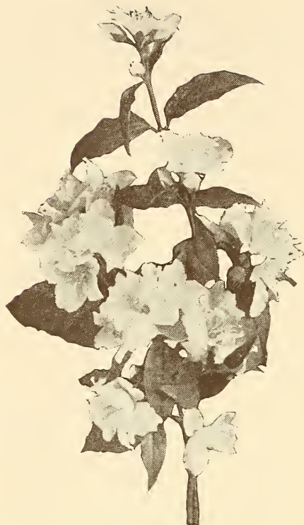
Mock-Orange Blossoms (Philadelphía Lemoinei)

with the foliage; the red fruit is also ornamental.