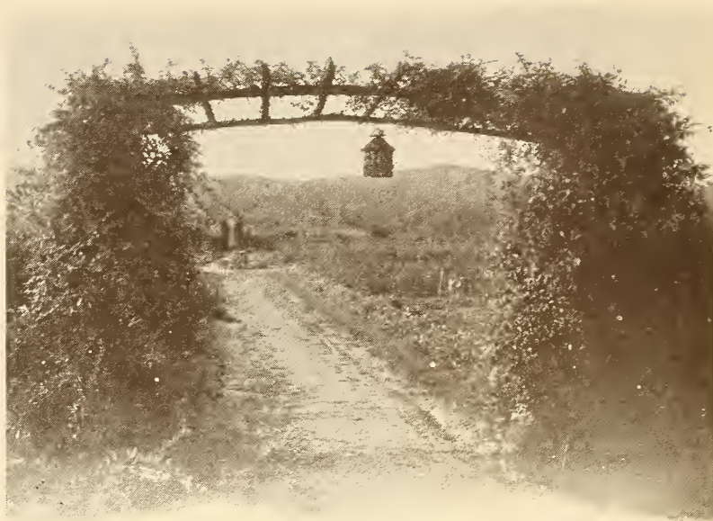
Honeysuckle at Entrance to Vegetable Garden

— Radicans . Very attractive, self-clinging vine, with small, rich green foliage and pink fruit. 25 cts. each; pot-grown plants, 35 cts. to 50 cts. each.