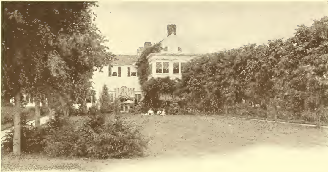
Silver Lindens in Formal Arrangement