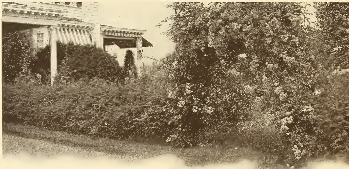
A Barberry Hedge (Bright with Red Berries in Winter)

— Rosea. Compact, strong-growing shrub with handsome rosy pink flowers in June and July. 2 to 5 ft., 50 cts. to $1 each.