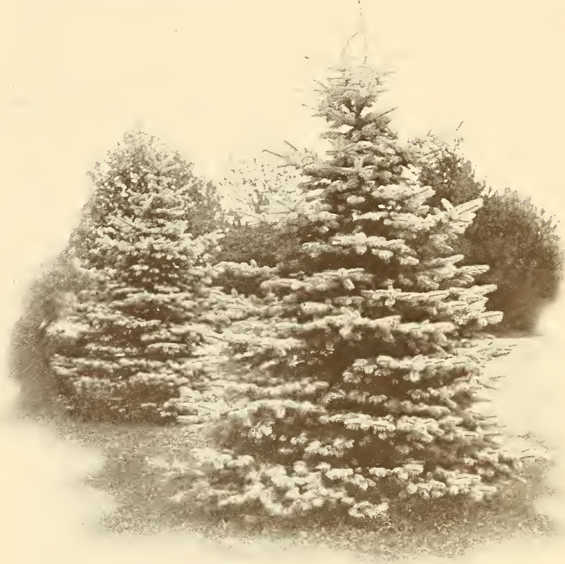
Koster's Blue Spruce As We Grow Them at Outpost Nurseries

— Cuspidata repandens . Very hardy, with long, dark green foliage. Of low, spreading habit, rarely growing over 4 ft. high. 1 to 1½ ft., $2; 2 ft., $3.50.