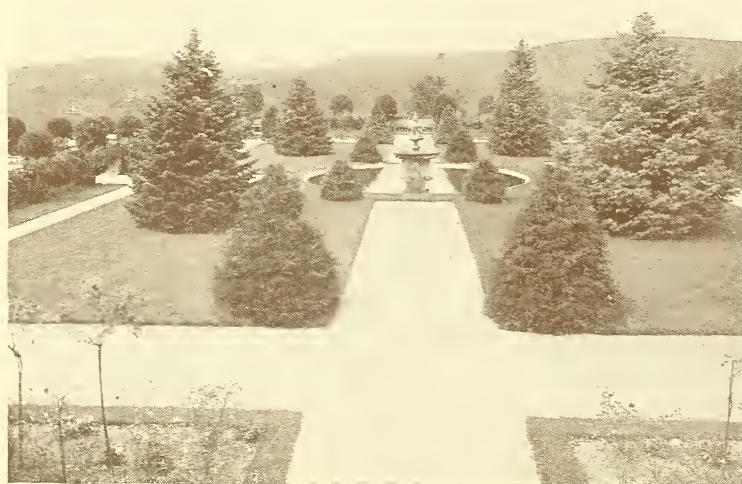
A Formal Planting of Evergreens

— Pieris (Andromeda) floribunda. A low, compact shrub, with small, dark green leaves. Pretty white flowers borne in small, dense, upright panicles at the ends