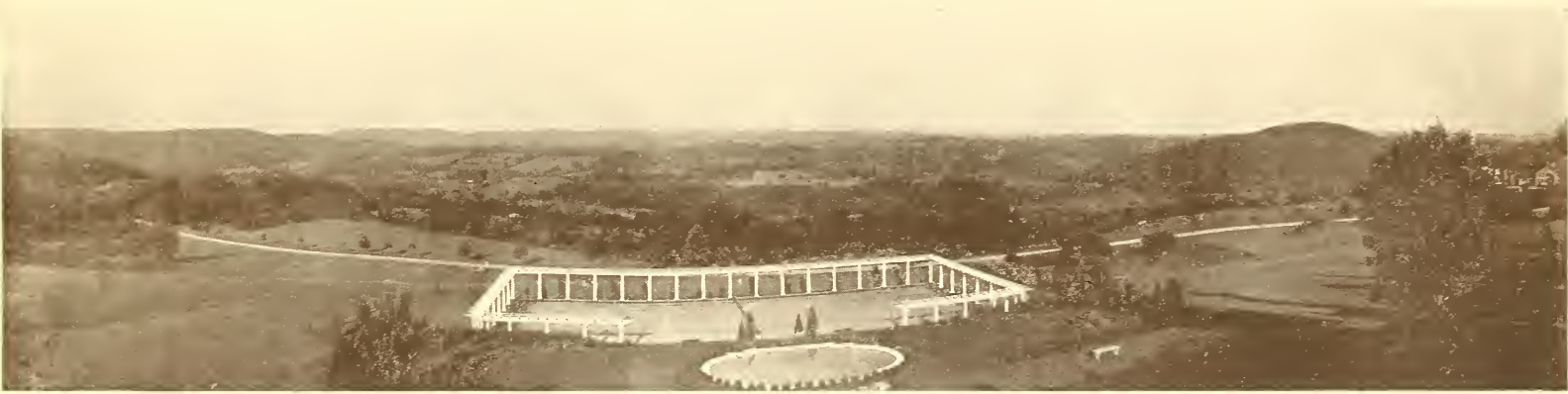
View on the Outpost Nursery Grounds.