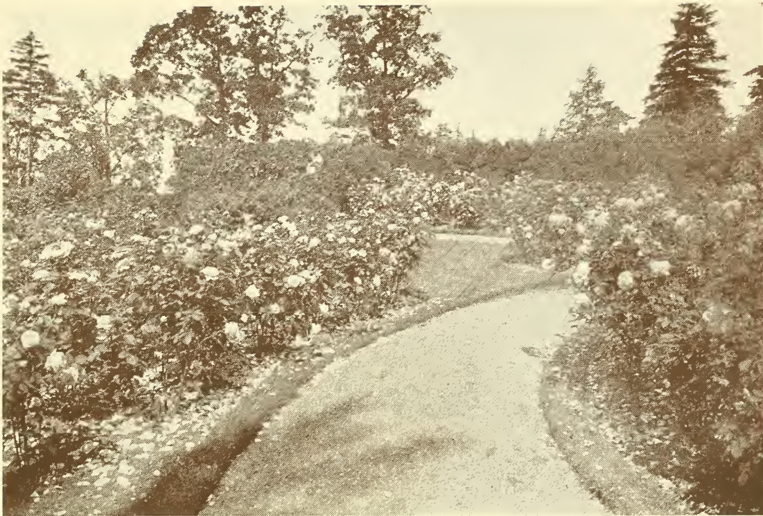
An Informal Rose Garden