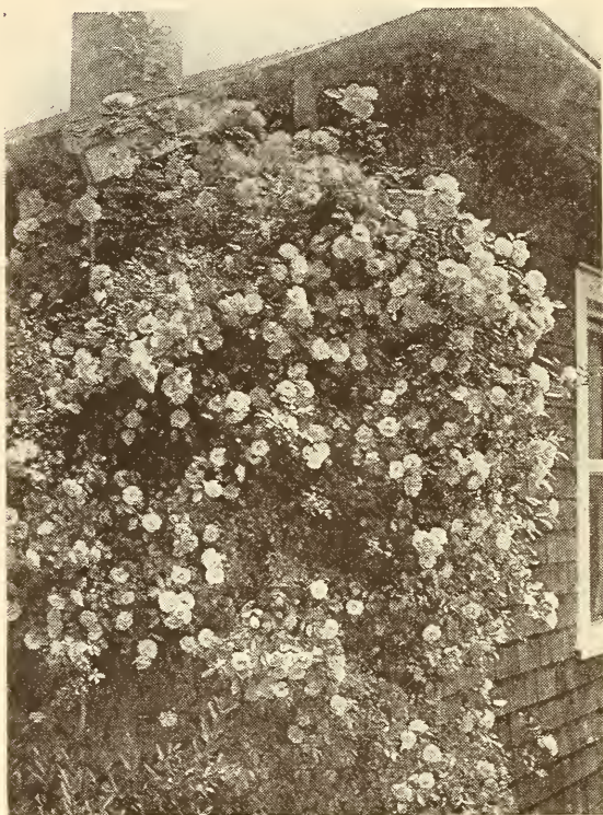
The Tausendschon Rose