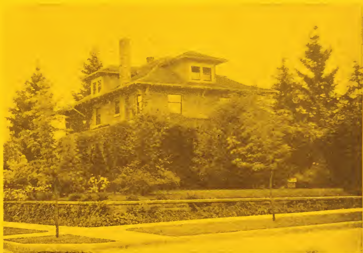
Home of the Mastick Dahlias

Are distinctly original and famous for their wondrous beauty of form and coloring