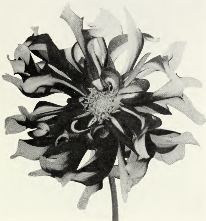
" FANTASTIQUE "