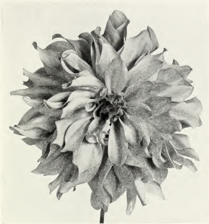
" SITKA "