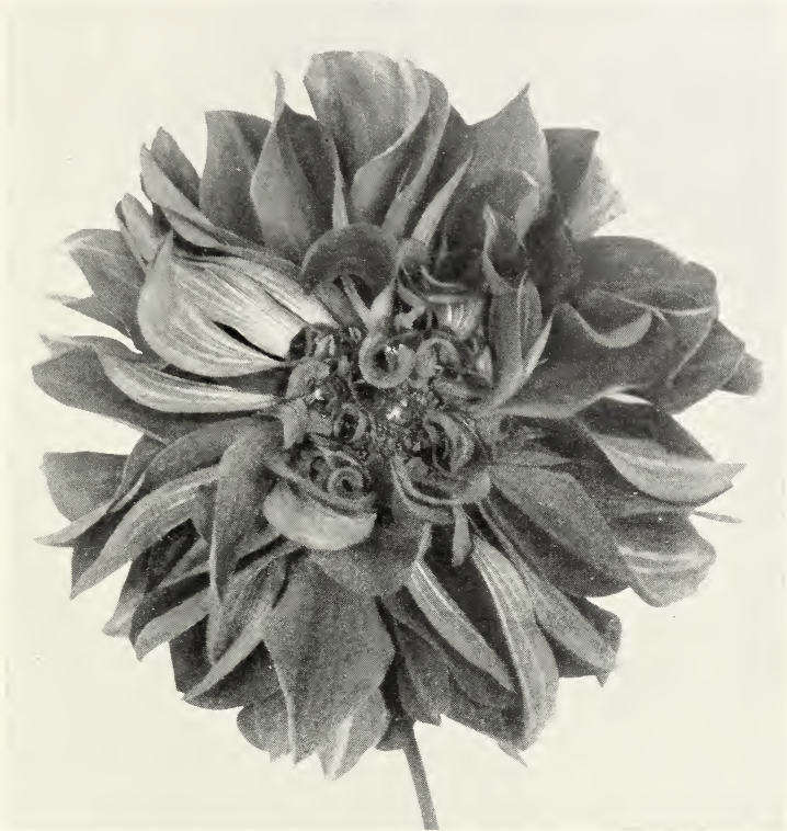
" TEKLA "