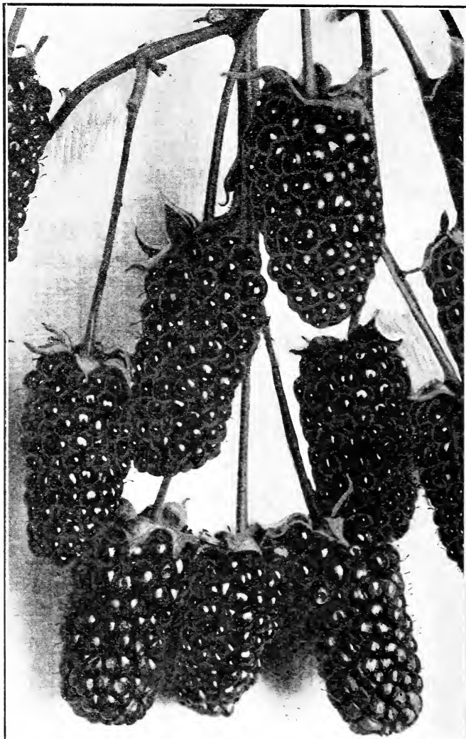
Photograph showing actual average size. Selected specimens can be shown three inches in length.

Cory's Thornless Blackberry is unlike any other berry grown. The canes start to grow early in the spring, growing thick and stout until about five or six feet long, when they take the trailing habit, at which time they should be trellised. It is a prolific grower, the canes often reaching 20 to 30 feet in a season. Individual plants under favorable conditions will produce from 150 to 200 feet of cane in a season. They can be pruned to suit your fancy. When exposed to the sun the canes are a deep red color. The foliage is large, thick and of a dark green. It is not an evergreen, but some of the leaves often stay on all winter.