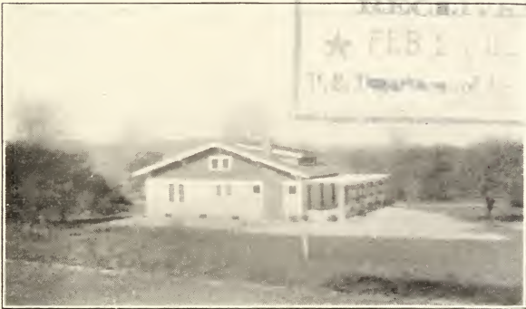
BIRDSEYE VIEW OF OUR HOME AND SURROUNDINGS

Growers of Trees, Shrubs, Perennial Plants, Roses, Etc.