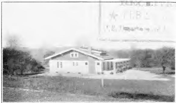
BIRDSEYE VIEW OF OUR HOME AND SURROUNDINGS

Growers of Trees, Shrubs, Perennial Plants, Roses, Etc.