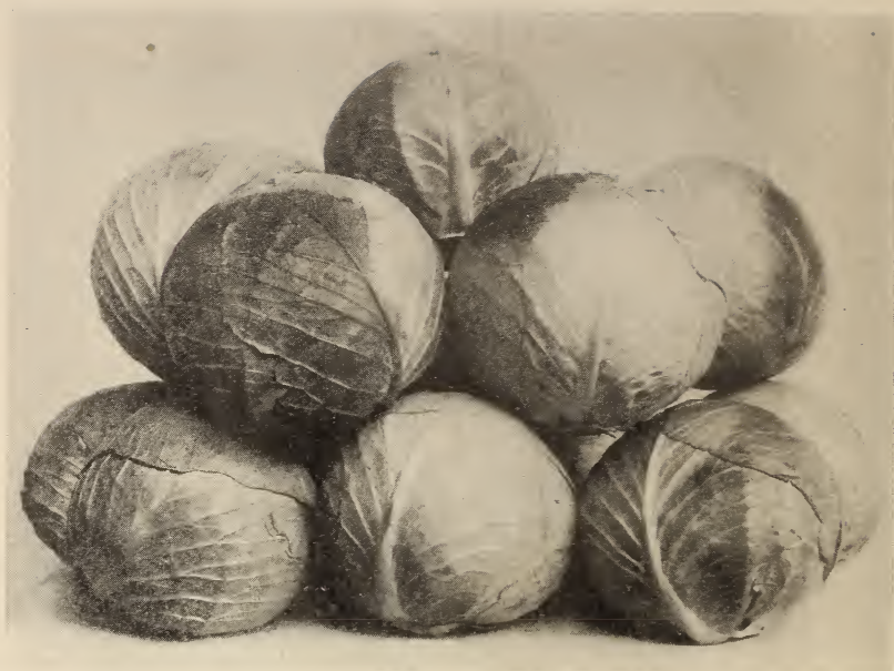
Back's Hollander or Danish Ballhead Shortstem. Own Strain, Treated Seeds.