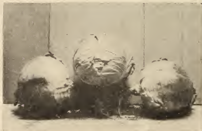
Back's Glory. Own Strain. Treated Seed.