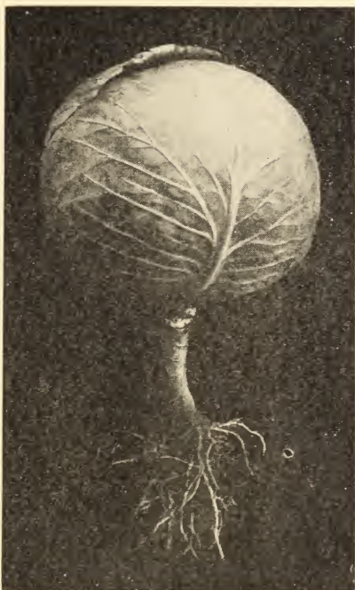
Back's Copenhagen Market