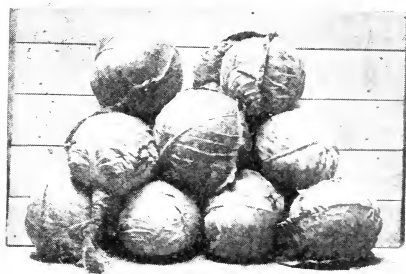
Back's Copenhagen Market. Own Strain. Treated Seed.