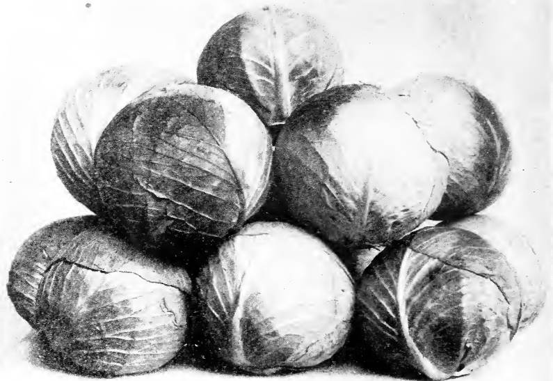
Back's Hollander or Danish Ballhead Shortstem. Own Strain, Treated Seeds.