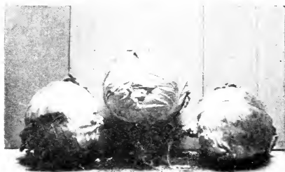
Back's Glory. Own Strain. Treated Seed.