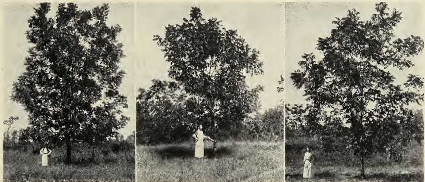
Reading from left to right—Stuart tree 12 years old. Indiana tree 8 years old. Busseron tree 10 years old. All in our grove at Petersburg bearing fine crops of choice pecans.

The production of nuts in this country is not keeping up with the demand. Nut importations into the United States increased from $8,549,997 in 1909 to $57,499,040 in 1919. Nuts are almost nonperishable. They do not have to be gathered and rushed to market.