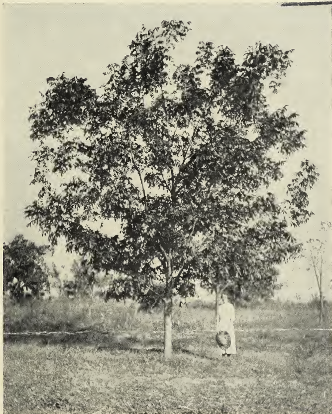
Indiana Pecan Tree in our grove ten years old. Produced 16 pounds of choice nuts this season.

PIONEERS IN THE PROPAGATION OF HARDY PECAN TREES FOR NORTHERN PLANTING. INTRODUCERS OF IMPORTANT NORTHERN VARIETIES OF PECANS AND GROWERS OF CHOICE THIN SHELLED PECAN NUTS.