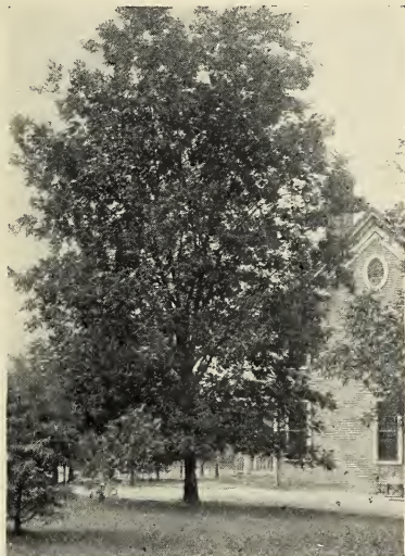
The Pecan makes a beautiful lawn tree.

With young trees of adapted varieties now in bearing in the northern part of the Pecan area, it is easy to determine somewhat definitely the returns that may be expected. The