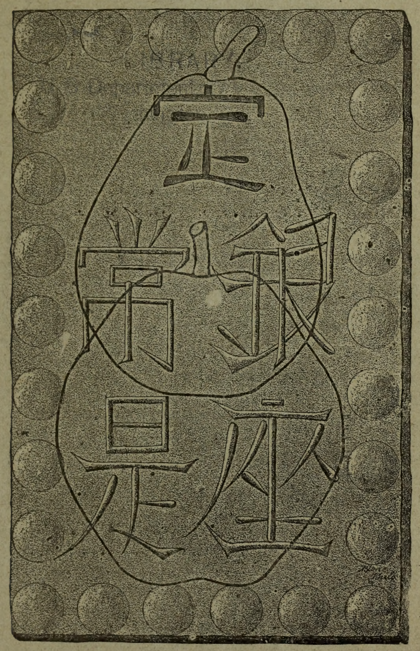
FOR THE TRADE ONLY.