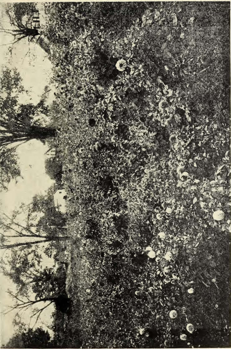
A VIEW OF ONE OF MY FIELDS