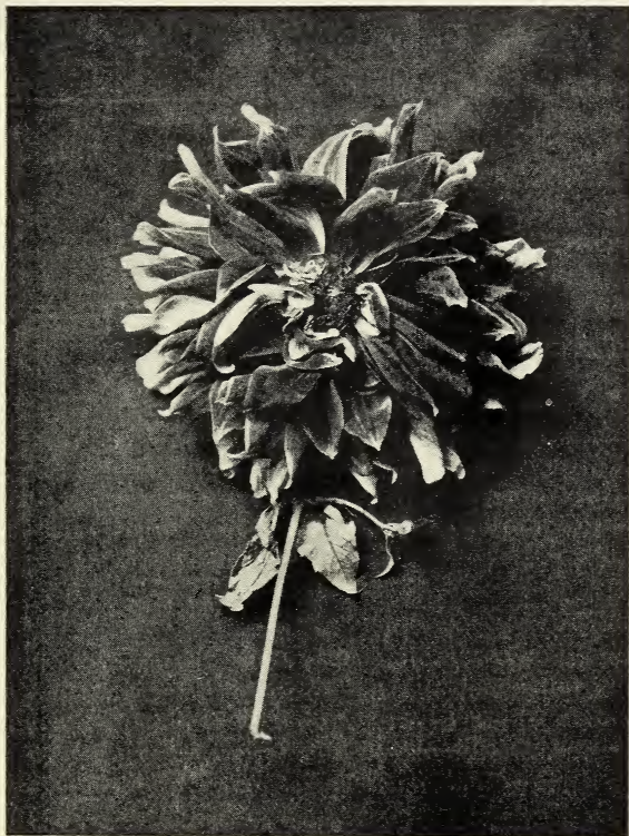
PRIDE OF NORWICH

PRIDE OF NORWICH —This new peony Dahlia is a wonder for size and color, the blooms are large with broad petals and good stems that hold the blooms well above the foliage. The color is an exquisite scarlet, reverse side of petals a soft light shade in which lavender, yellow and light red are wonderfully blended; petals beautifully curled with a