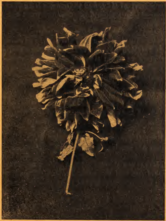
PRIDE OF NORWICH