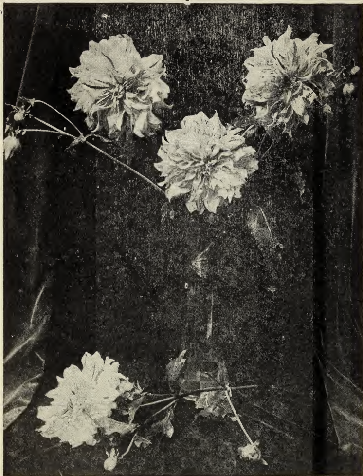
THE ROBERT OGDEN FLETCHER