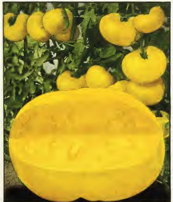
Golden Ponderosa Tomato