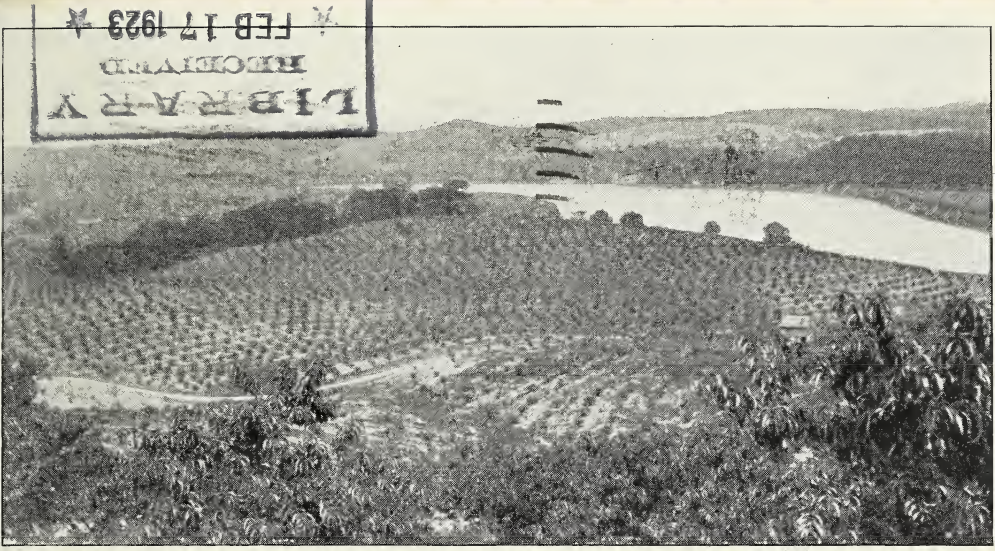
These trees were set out in the spring of 1921; this picture was taken a few months later. Note the strong growth; our trees take hold and grow because they're given the proper start in the nursery.