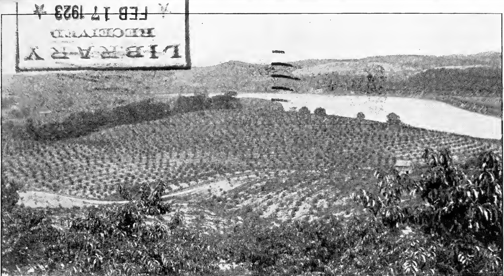
These trees were set out in the spring of 1921; this picture was taken a few months later. Note the strong growth; our trees take hold and grow because they're given the proper start in the nursery.