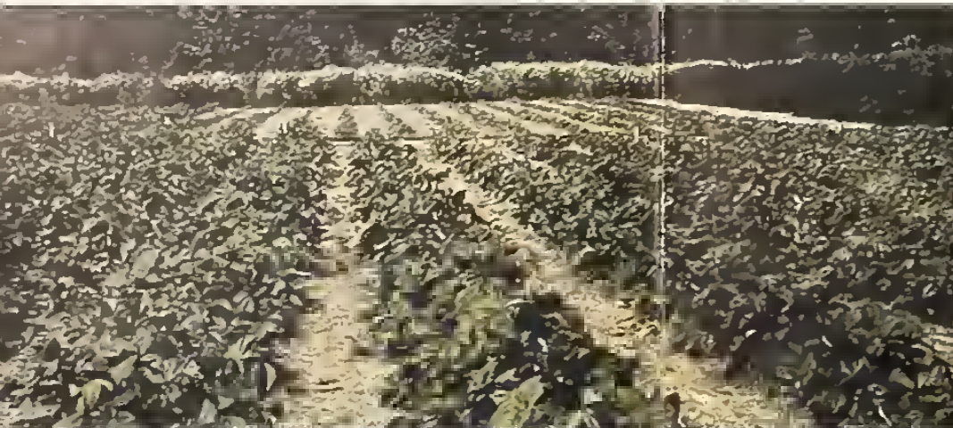
Strawberry Bed Showing Plants Grown in the Matted Row System.

Autumn or Spring Planting As to which is best is a matter of soil, location and varieties to be planted. On heavy clay, or low wet ground would not advise fall planting. On well drained such stock as Maples, Elms, Lindens, hardy shrubbery, Peonies, Phlox, Currants, Grapes, Red Raspberries and Blackberries, if well planted and properly mulched, may be put out in the fall. On other stock we advise spring planting in this climate.