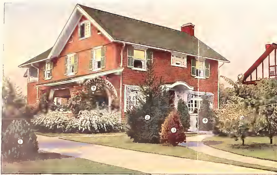
No. 1—Mugho Pine, No. 2—Norway Spruce, No. 3—Golden Arbor-Vitae, No. 4—Conecort Fir, No. 5—Bechtel's Flowering Crab, No. 6—Spiraea Van Houttei, No. 7—Crimson Rambler.