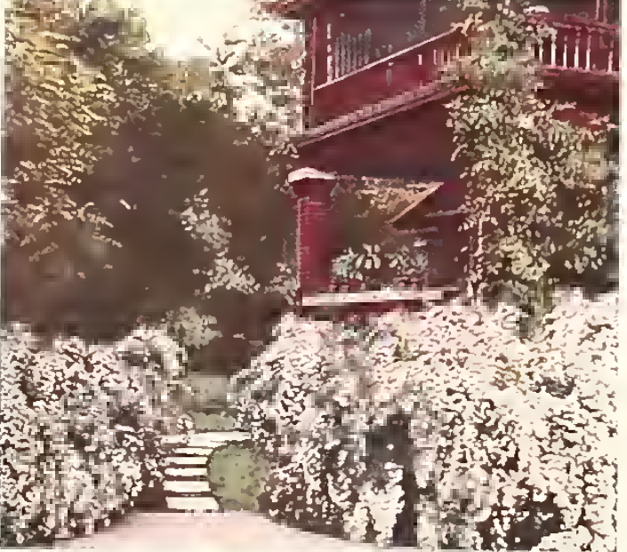
Spiraea Van Houttei.

WISCONSIN WEEPING WILLOW. The best Weeping Willow for this climate. A very graceful, rapid-growing tree.