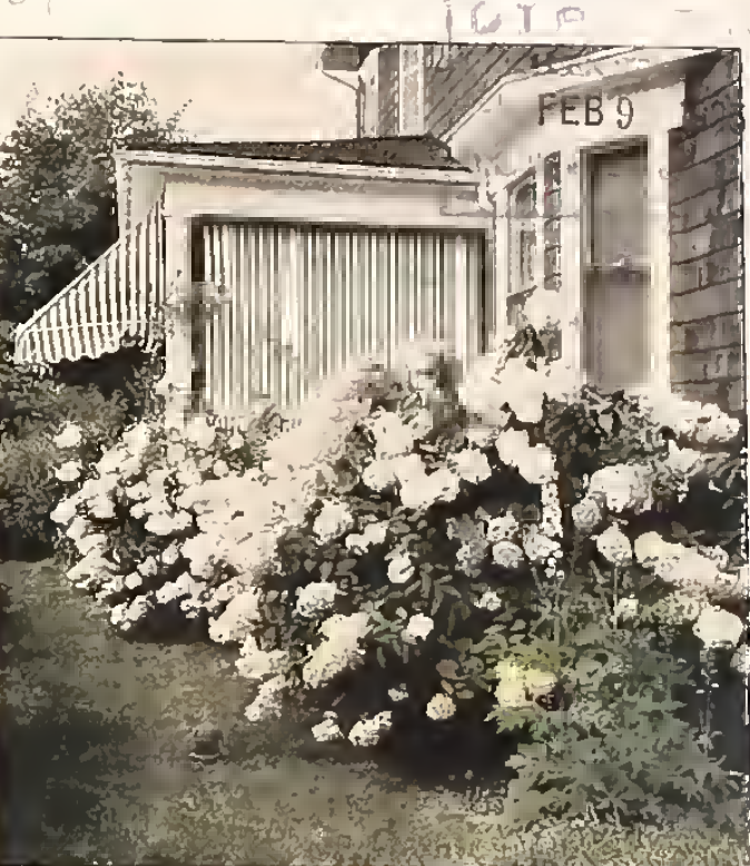
This cut shows a group of Hydrangea Paniculata Grandiflora used in foundation planting.

THIS folder places before you a list of varieties that we consider leaders in their particular class. They combine hardiness, productiveness and vigor of growth. We have included only those sorts that, from our own experience and the reports of others, are a success over a wide range of territory.