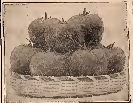
Potato Seed Balls—One-third Size. These Very Rare Seed Balls are Produced on the Top of Potato Vines.

If Premiums are preferred—remit 10 cts. per Packet, and for a $4.00 order I will send 40 Packets and a splendid Boy's or Man's Nickel Silver Watch—or Girl's Size for a $6.00 order. They are beauties, superb time-keepers and pretty as $25.00 Watches. I have other charming Premiums. Please show my offer to all Club-Agents and to every Boy and Girl who wants an elegant Watch. Your Friend and Well Wisher, A. T. COOK.