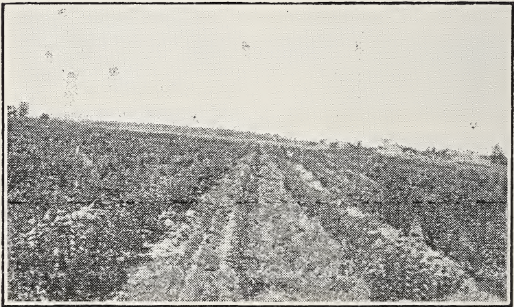
A Block Of Thrifty Young Shrubs.