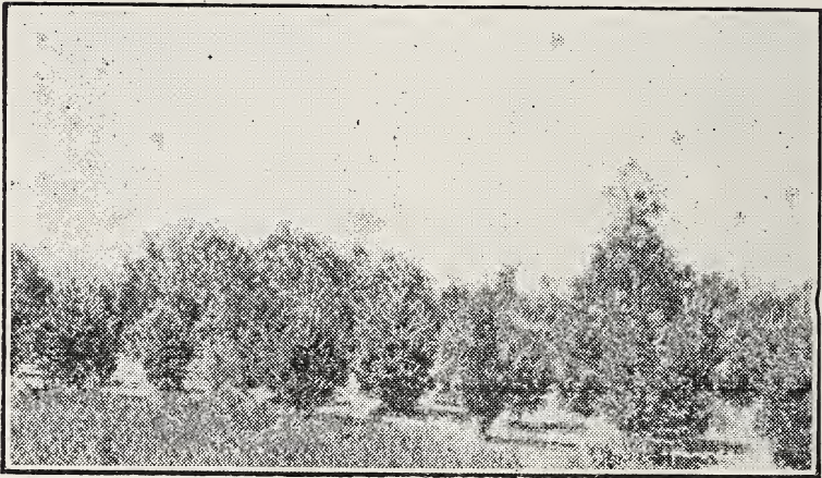
Specimen Evergreens For Your Home Grounds.