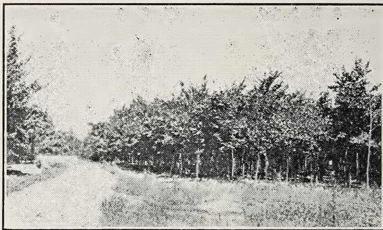
These Trees Are Spaced Four Feet Apart.